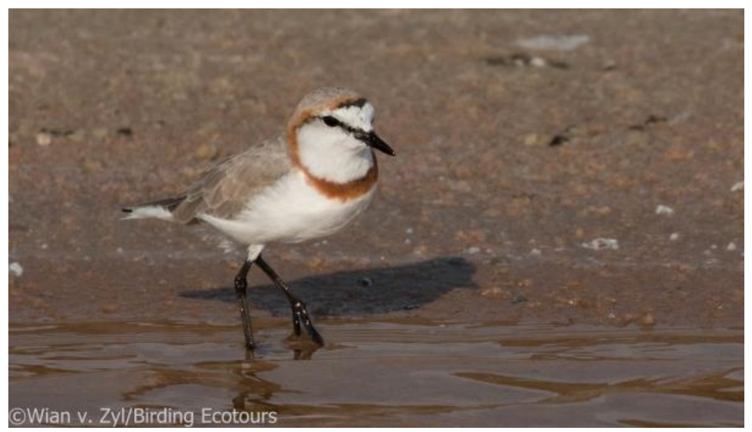
Chestnut-banded Plover - Charadrius pallidus

Our last hide before leaving the park produced Sandwich and Greater Crested Terns , White-fronted and Kittlitz's Plovers , Kelp and Hartlaub's Gulls , Grey Heron , and Cape Cormorant . We ended the day with Verreaux's Eagle , Grey-backed Cisticola , Rock Kestrel , Crowned Lapwing , and Rock Martin . Mammals for the day included common eland, springbok, chacma baboon, and large grey mongoose.