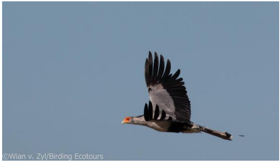
Secretarybird – Sagittarius serpentarius

the lodge, and here we managed to record Streaky-headed Seedeater, Cape Weaver, Southern Double-collared Sunbird, a very curious Cardinal Woodpecker, Fiscal Flycatcher, an obliging Bar-throated Apalis, and Cape Bunting. Other species included Acacia Pied Barbet, Whimbrel, Yellow Bishop, Cape Robin-Chat, and Cape Sparrow.