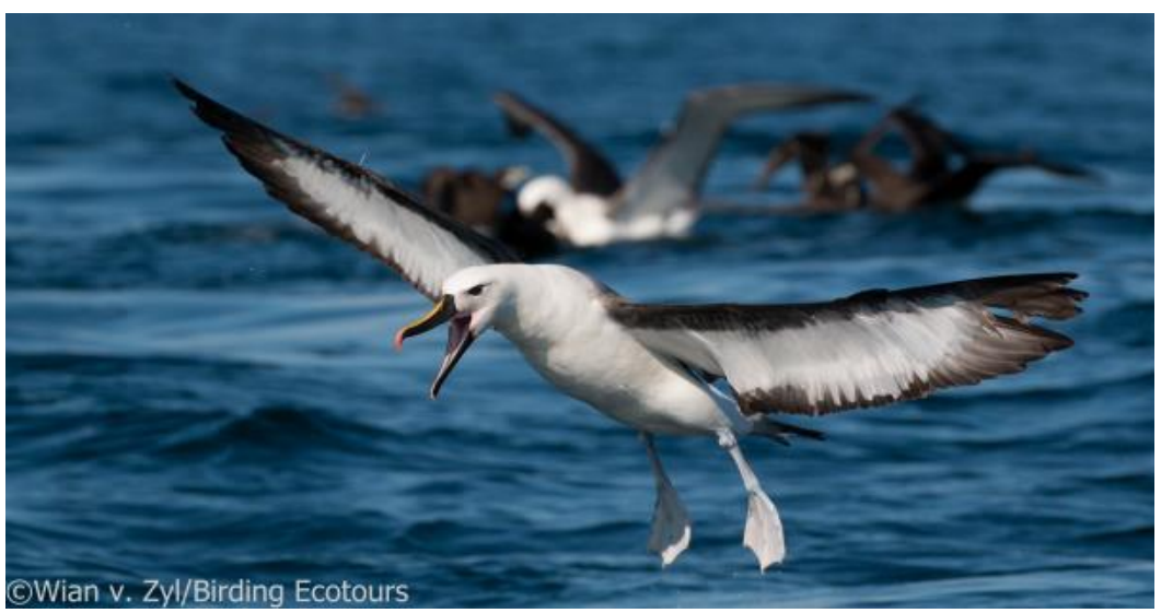
Indian Yellow-nosed Albatross – Thalassarche carteri

It was a great day out at sea; the weather conditions were perfect with glass-like water, and the birds were showing in their thousands.