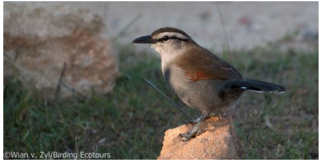
Southern Tchagra – Tchagra tchagra

In conclusion, the tour turned out to be successful and very enjoyable. For the most part the weather played along and we had beautiful days in the field, we were offered some really spectacular photographic opportunities, and we managed to see a majority of the specials and endemics multiple times. The Western Cape Province never seizes to amaze, and we ended up recording 193 bird species, of which 15 were endemics and only two were only heard. Our mammal list contained 16 species, which included two marine mammals.