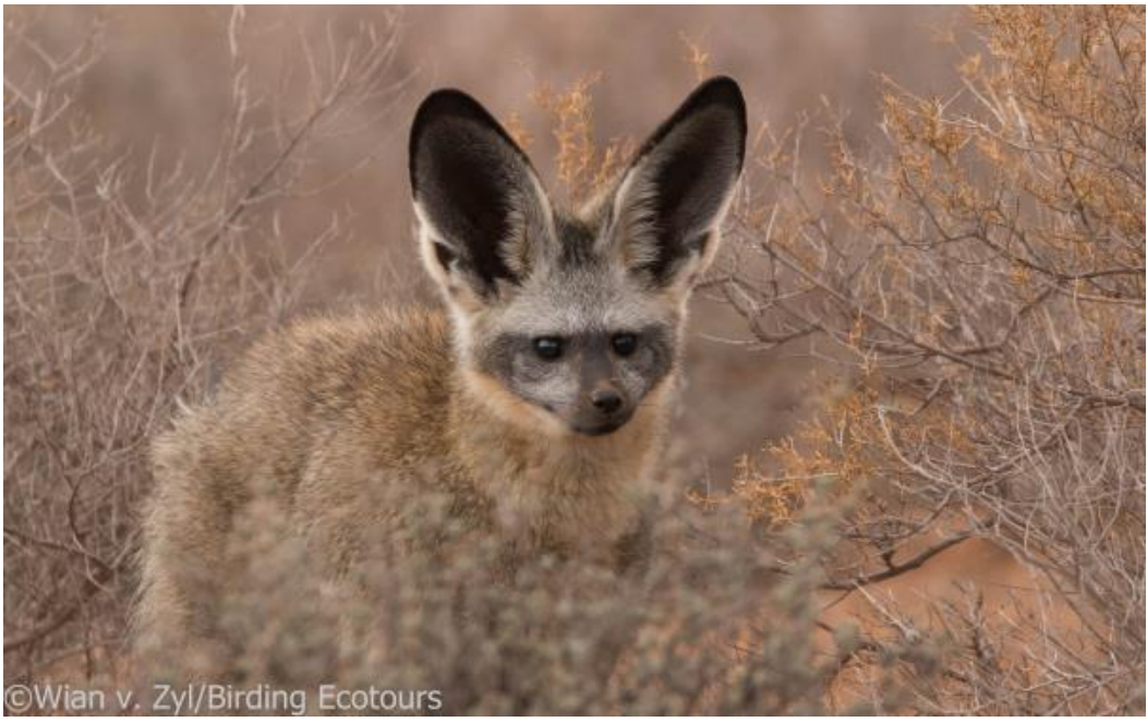
Bat-eared Fox - Otocyon megalotis

(because of a festival called "Africa Burning" further north), and as a result we didn't see too much along the dusty main road as we made our way to the lodge. As soon as we got off the main road we managed to lay eyes on Karoo and Tractrac Chats , Spike-heeled Lark , and bat-eared foxes feeding really close to us.