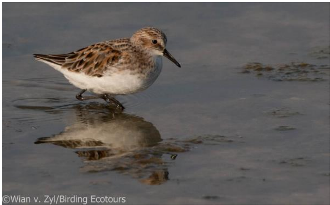
Little Stint – Calidris minuta

After dropping our luggage off at the guest house, which is a stone throw away from Kirstenbosch Botanical Garden, we made our way straight to the botanical garden. After entering we were soon pleased to see Olive Thrush , Sombre Greenbul , Southern Double collared Sunbird , Cape White-eye , and African Dusky Flycatcher . We meandered along the pretty, busy garden and entered the forested section, where we soon found Lemon Dove , Brimstone Canary , a brief visual of Forest Canary , Cape Robin-Chat , and Cape Spurfowl . We walked along the flower gardens and further recorded Orange-breasted Sunbird , Swee Waxbill , Karoo Prinia , Cape Batis , and Helmeted Guineafowl . Other species here included Red-eyed Dove , Red-winged Starling , Cape Wagtail , Fiscal Flycatcher , and Black Saw-wing .