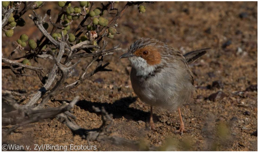
Rufous-eared Warbler – Malcorus pectoralis

We arrived in the Cape Town area around mid-day and soon found Greater Flamingo, Cape and White-breasted Cormorants, Kelp, Grey-headed, and Hartlaub's Gulls, Blackheaded Heron, African Oystercatcher, Rock Martin, Speckled Pigeon, and Cape Wagtail. The rest of the afternoon was spent gift-shopping (on clients' request) and resting for the pelagic trip the next day.