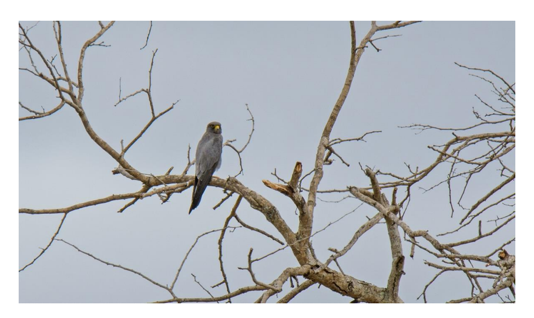
The Sooty Falcon – Distant, but what a bird, just look at the incredibly long wing projection - Photo Dylan Vasapolli

"Did someone just say Sooty Falcon? " What, near the Lake Panic turn-off? Let's go! Chaos hit Flock 2016 with rumors that a Sooty Falcon was reported near the Lake Panic turn-off. Jason was close by and arrived soon to report the good news! The falcon was perched up nicely and looked really relaxed – good visuals were had by most of the keen birders over the course of the day. What a bird! Well done to Duncan Mckenzie for re-finding the bird that morning and reporting it.