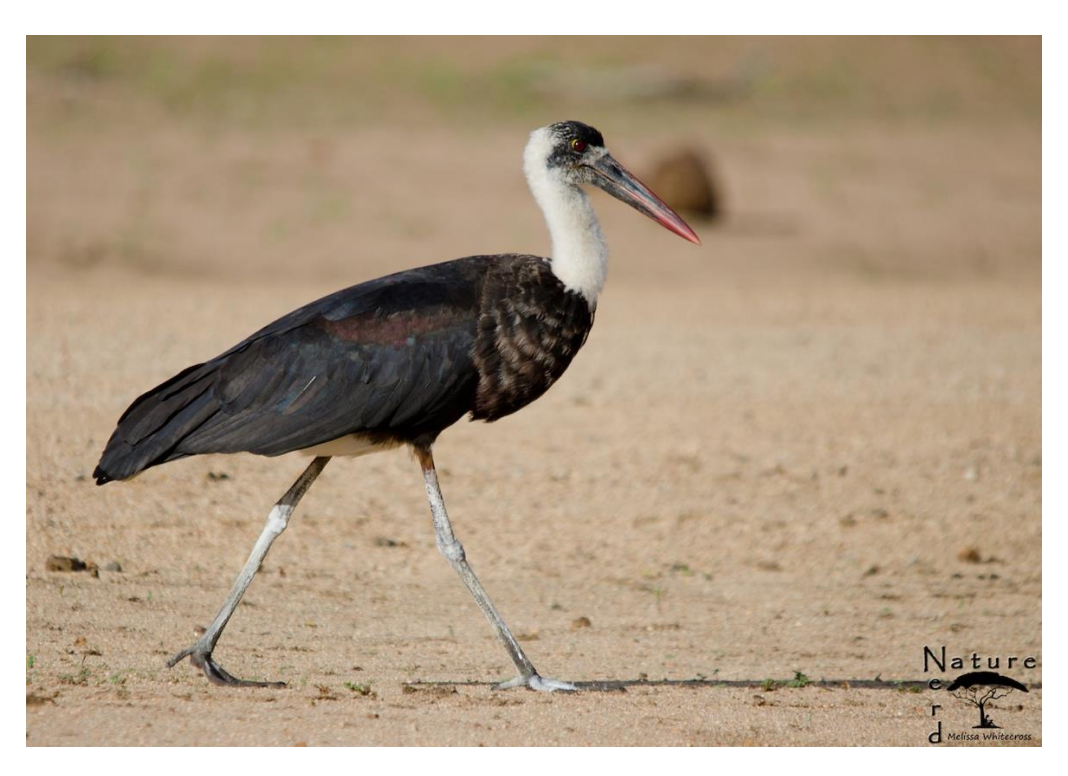
A Woolly-necked Stork strutting across the road