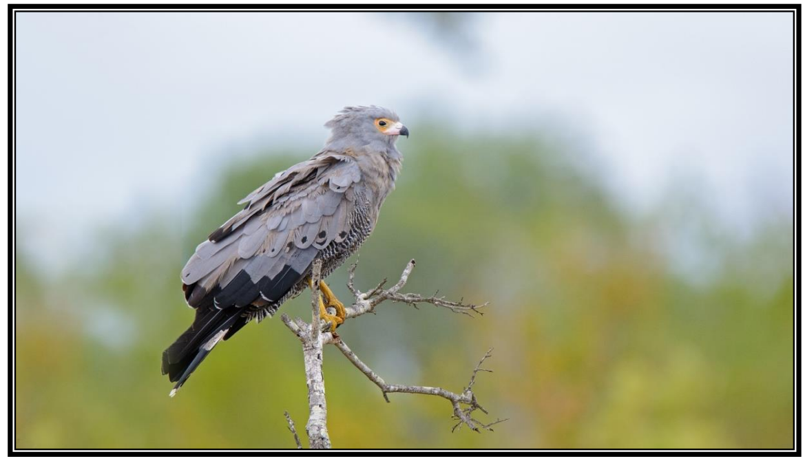
Many African Harrier-Hawks were seen during the course of Flock