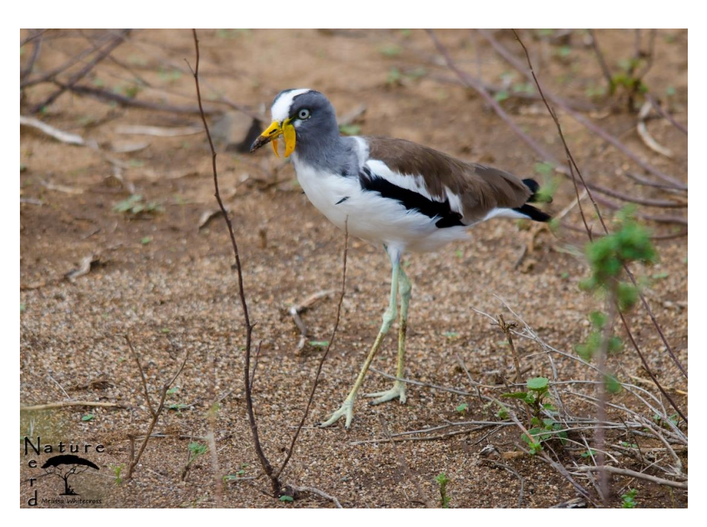
White-crowned Lapwing

"Did someone just say Sooty Falcon? " What, near the Lake Panic turn-off? Let's go! Chaos hit Flock 2016 with rumors that a Sooty Falcon was reported near the Lake Panic turn-off. Jason was close by and arrived soon to report the good news! The falcon was perched up nicely and looked really relaxed – good visuals were had by most of the keen birders over the course of the day. What a bird! Well done to Duncan Mckenzie for re-finding the bird that morning and reporting it.