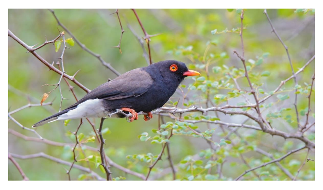
The stunning Retz's Helmetshrike – what a great bird!