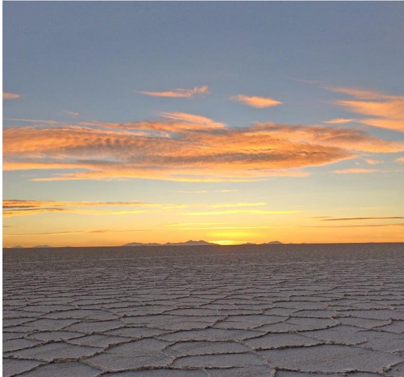
Oyuni Salt Plains (Jacques Smuts)

The next day we flew to Uyuni in the Altiplano for two days' extension to visit the Great Salar de Uyuni, the largest extension of salt on the planet. This place is probably one of the highlights of South America. The photography opportunities for natural scenery were outstanding, and even though life is extremely scarce in this desert of salt we managed to see James's and Chilean Flamingo and Black-hooded and Mourning Sierra Finch .