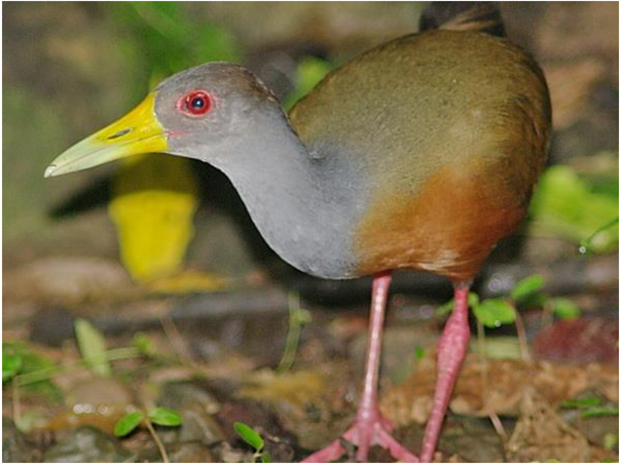
Grey-necked Wood Rail

Purple Gallinule Porphyrio martinicus An adult and a juvenile were seen near the Sarapiquí River.