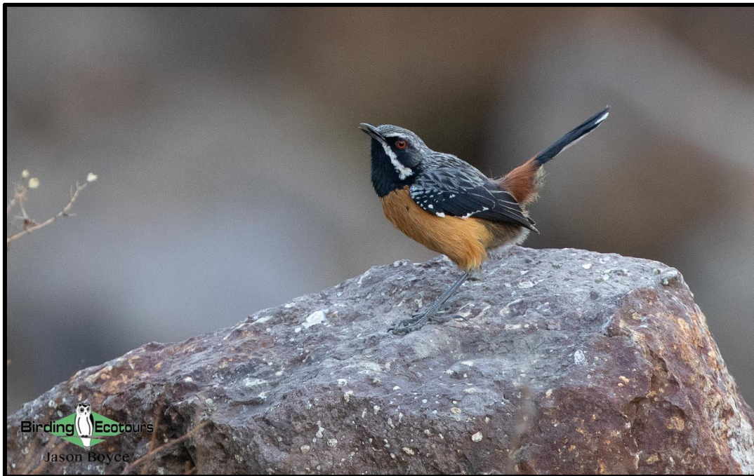
Probably one of the birds of the trip –Drakensberg Rockjumper

Lesotho produced nice sightings of Southern Bald Ibis , Grey Tit , Layard's Warbler , and Ground Woodpecker . We also managed to find one of the areas where Bearded Vultures have been known to breed. A single bird was cruising around effortlessly, occasionally perching on the cliff sides. The way back down gave us the one species we were missing, the male Drakensberg Rockjumper . We enjoyed watching a very confident bird move around feeding and occasionally perching for nice photographs. Barratt's Warbler was our last new species for the day; it took some time to get visuals of this skulker, but once it came out we really had some nice views.