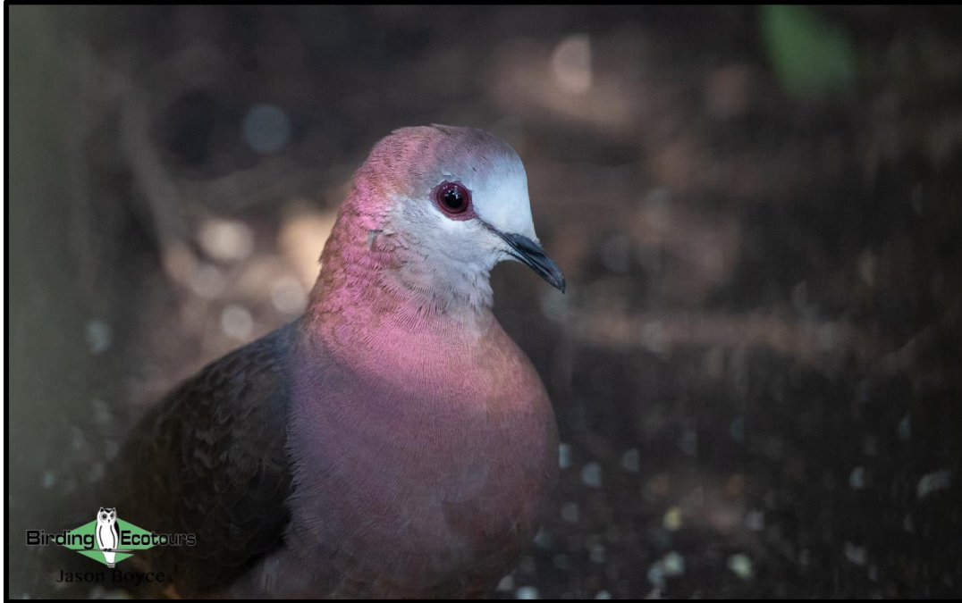
Lemon Dove showing its beautiful colors under a ray of sunlight