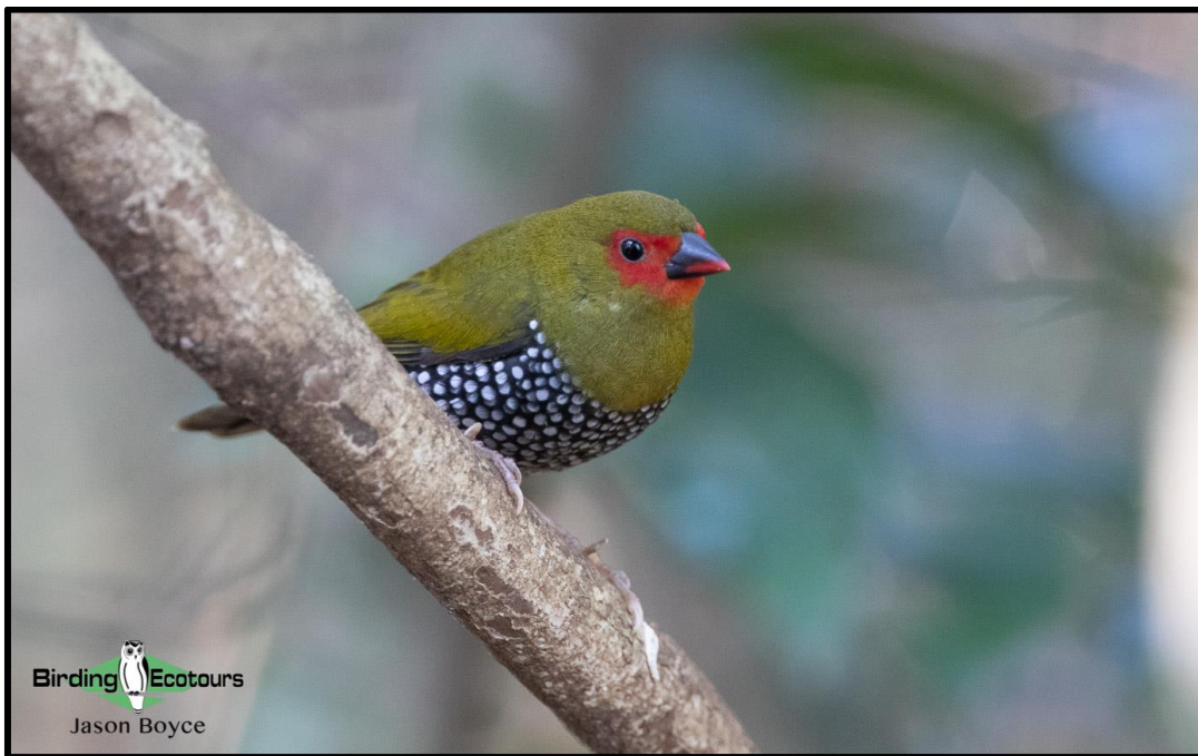
The awesome male Green Twinspot showed well at the hide.