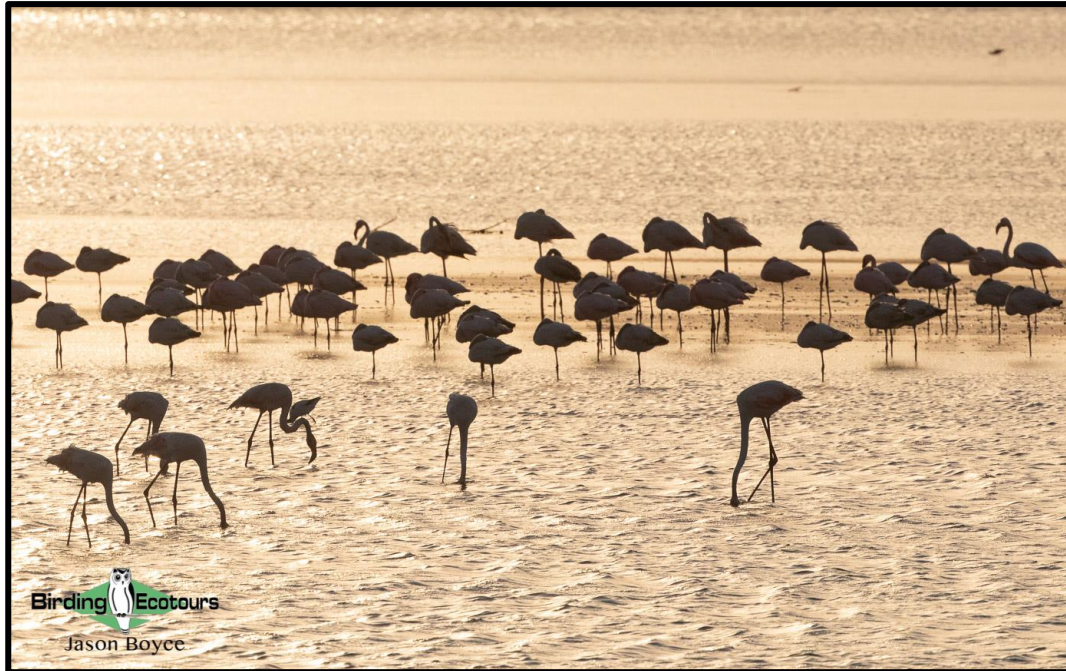
Estuary birding at St Lucia, Greater Flamingo

of different birds, with Great Egret , Goliath Heron , Yellow-billed Stork , Black-winged Stilt , a few more Pink-backed Pelicans , flamingoes, and Caspian Terns all standing out well due to their larger size. Rudd's Apalis and Red-capped Robin-Chat were singing with some gusto behind us as the sun was setting. We decided to call it a day and looked forward to tomorrow.