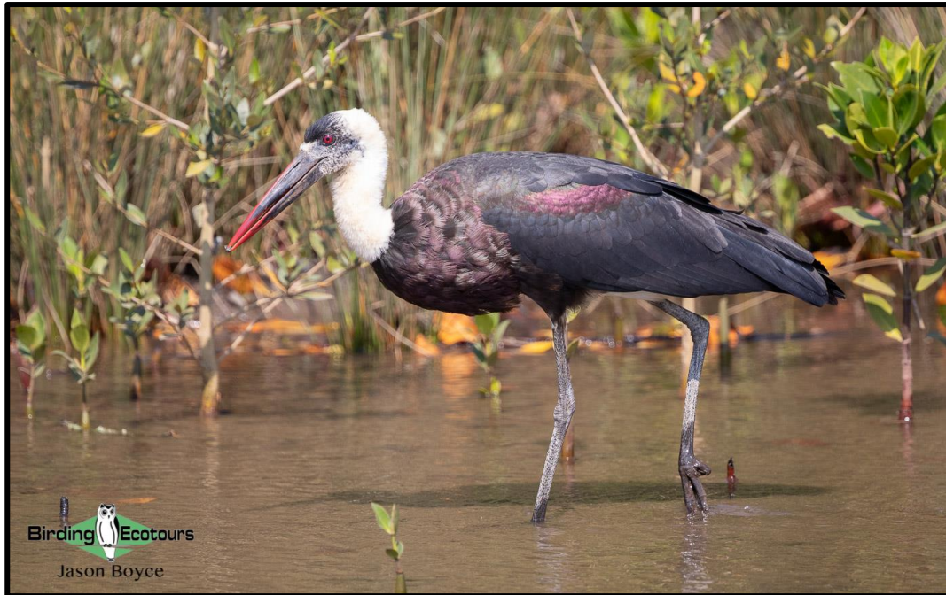
Woolly-necked Stork along the Umlalazi River