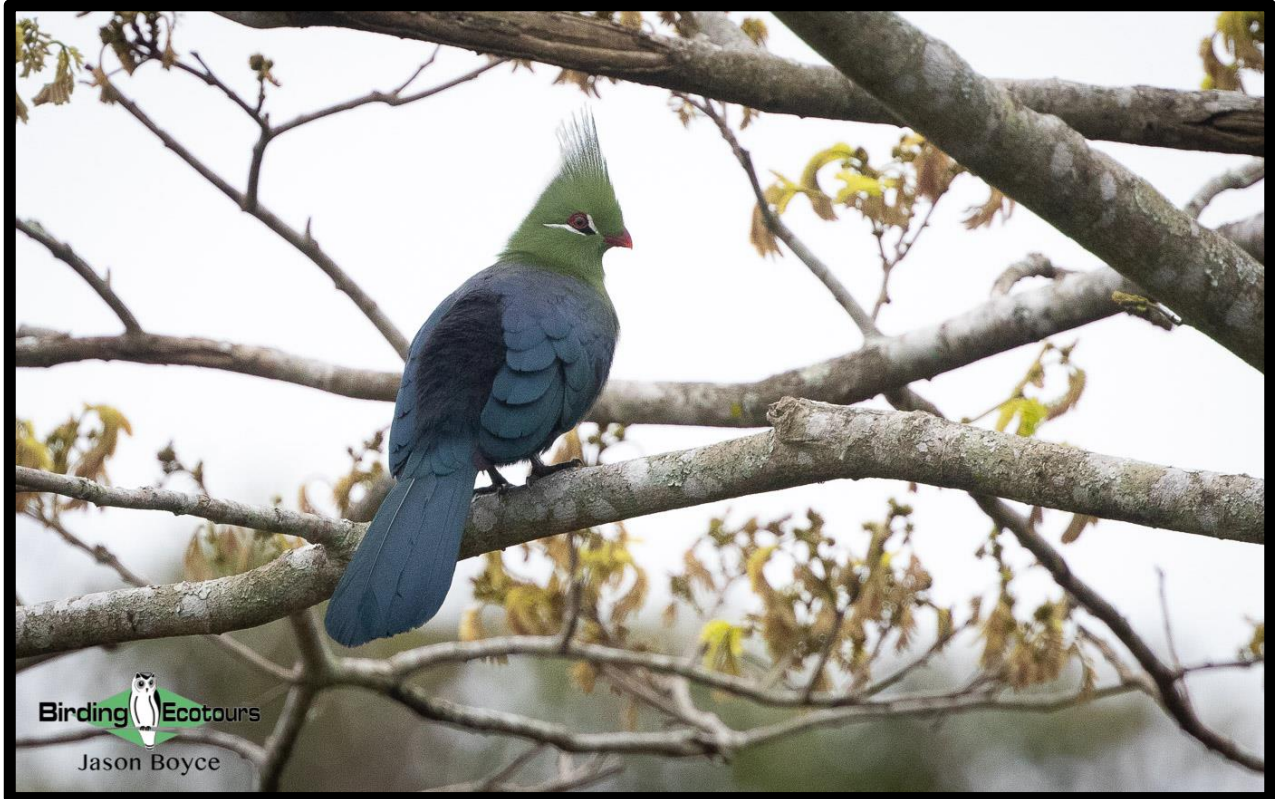
Livingstone's Turaco showed beautifully for us in the iSimangaliso Wetland Park.