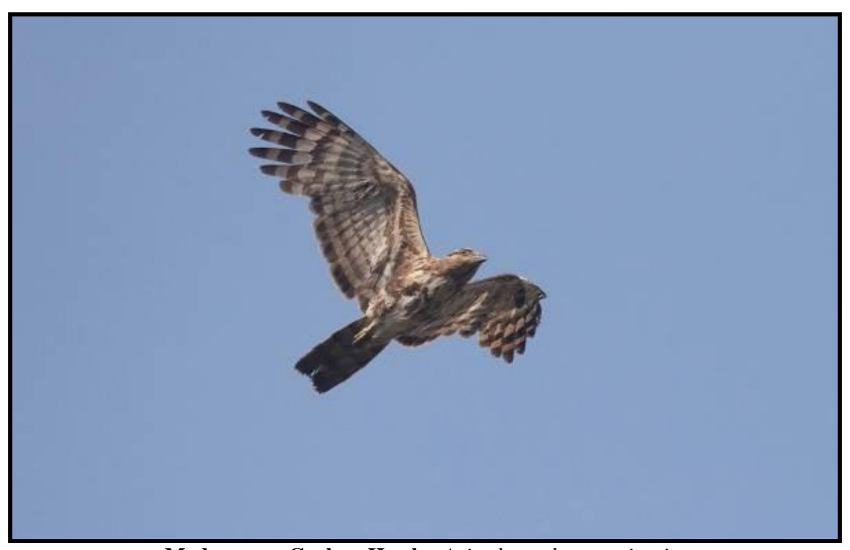
Madagascan Cuckoo-Hawk - Aviceda madagascariensis

Arriving at the lake we encountered Malagasy Bulbul, Cuckoo Roller, African Palm Swift, Common Moorhen, White-throated Rail, Malagascan Rail, Malagasy Harrier, and undoubtedly the bird of the day, and perhaps one of the rarest birds in the world. The bird in