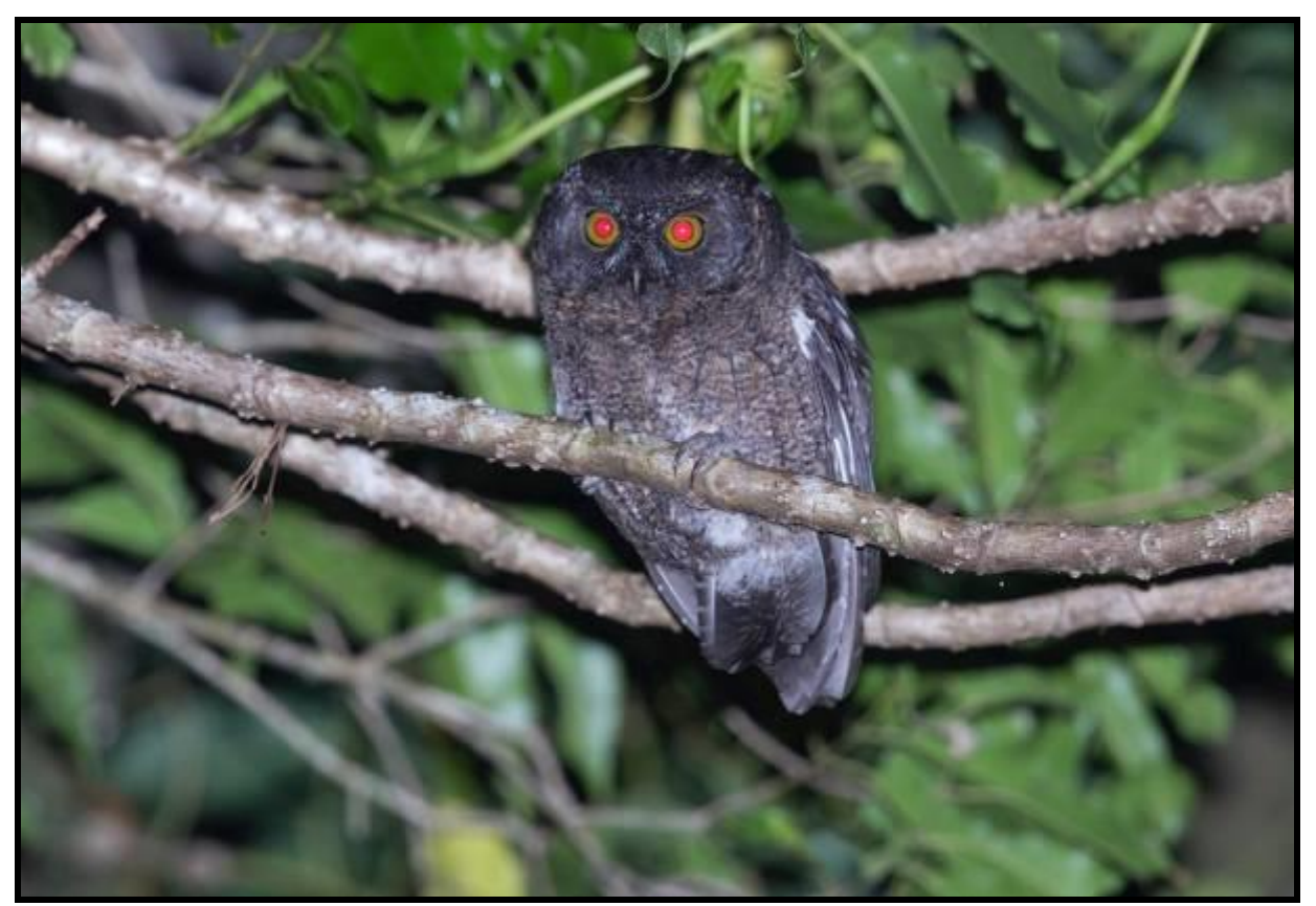
Karthala Scops Owl - Otus pauliani