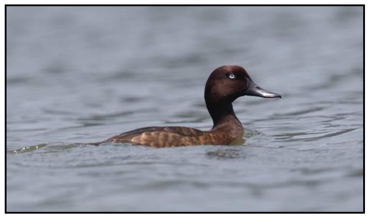
Madagascan Pochard - Aythya innotata

question, Madagascan Pochard , is a species previously thought to be extinct in the wild, until a population of less than a dozen birds was located on this lake. Through conservation efforts the population now stands at 28 birds, 16 of which we saw that day, including freshly hatched chicks. In the evening we quickly located Rainforest Scops Owl and Madagascan Owl , another two prime targets of the owling trip.