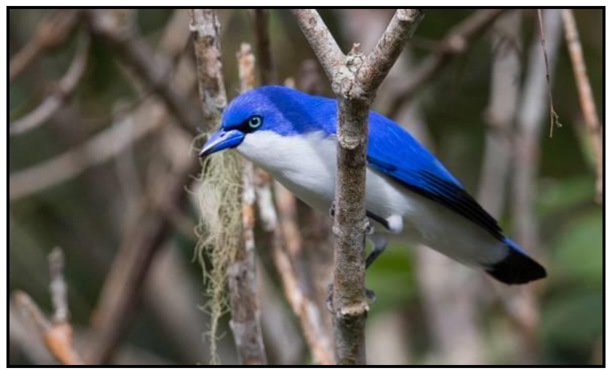
Blue Vanga - Cyanolanius madagascarinus (Comoros subspecies, potential split)

Greater Vasa Parrot, African Palm Swift, Moheli Bulbul, Malagasy White-eye, Malagasy Green Sunbird, Yellow-billed Kite, and spectacular flybys onto the volcanic ridges of Peregrine Falcon and a pair of the sought-after Malagasy Harrier before we headed back to town to prepare for our departure in the morning.