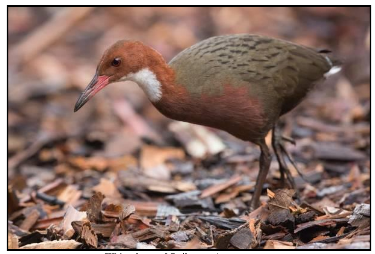
White-throated Rail - Dryolimnas cuvieri

Later in the afternoon we took a lengthy hike into a nearby forested area, picking up Common Quail and Madagascan Lark and flushing a Madagascan Nightjar along the way. Passing a small lake we added Red-billed Teal, Meller's Duck, and Malagasy Kingfisher before entering the forest, where we immediately set out to seek the main target of this trip, Red Owl, by far the most uncommon of the owls the island has to offer and one which very few world birders have laid eyes upon. It took us a fair amount of time, but a little way off the beaten track we struck gold with an adult bird, hidden neatly in the cavity of a very large tree. We spent over an hour with the bird, watching it watching us. We finally had to leave only due to the fading light and not to our lack of interest in the sighting. A Malagasy Harrier again put the cap on the day, hunting low over the grasslands in the late afternoon's golden light.