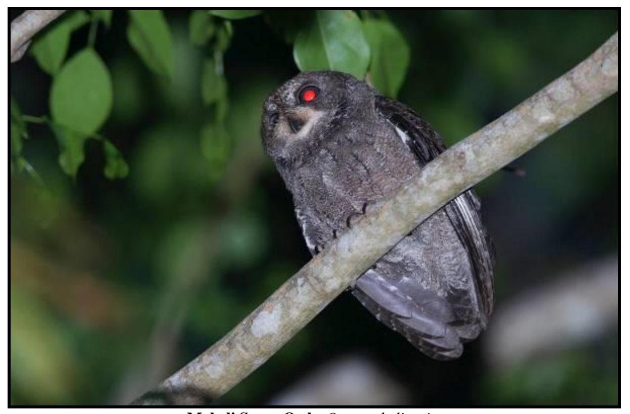
Moheli Scops Owl - Otus moheliensis

Touching down in Mohéli, we again wasted little time before heading for the forests, and with this island being so much smaller it took no time at all to do so. House Sparrow was once again present, along with Western Cattle Egret, Common Myna, Pied Crow, Humblot's Sunbird, Malagasy Paradise Flycatcher, Rock Dove, African Palm Swift, Comoros and Red Fodies, and countless flying foxes, which fed on the mango plantations scattered along the hillsides. Just before dark the first calls of Moheli Scops Owl started to pierce the air, and it was not long before we had great views of both color morphs – and of a complimentary Western Barn Owl too.