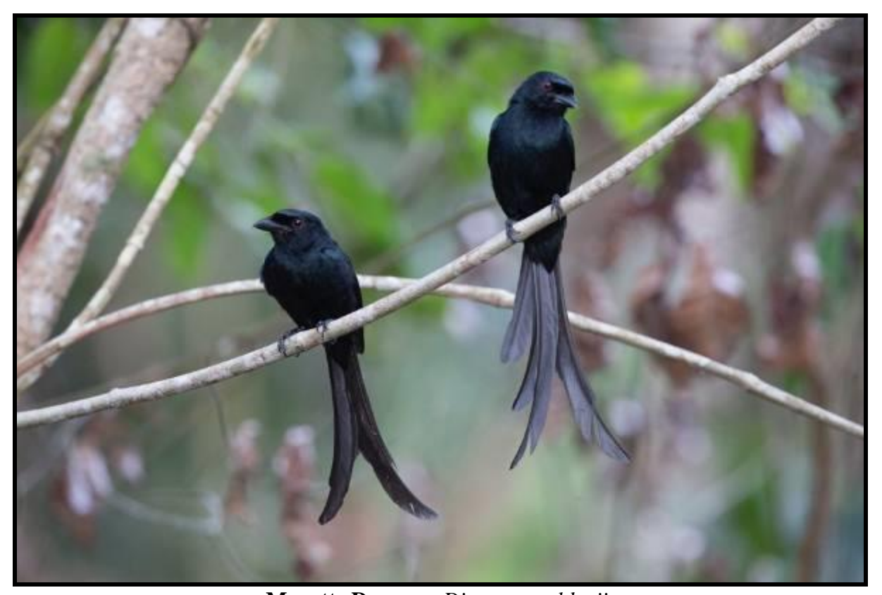
Mayotte Drongo - Dicrurus waldenii

road. While loading the vehicle, a flock of diminutive birds moved through overhead, the call unmistakable, and it was not long before we caught up with them: Mayotte White-eye , our final endemic for the island! We left to go owling, with serious smiles all around. The little night walk produced a hefty common tenrec, sleeping brown lemurs, and then the most amazing views of a pair of Mayotte Scops Owls calling to each other and then sidling up to one another above our heads, where they then began to preen each other – a great end to our visit to the islands of the Comoros and Mayotte.