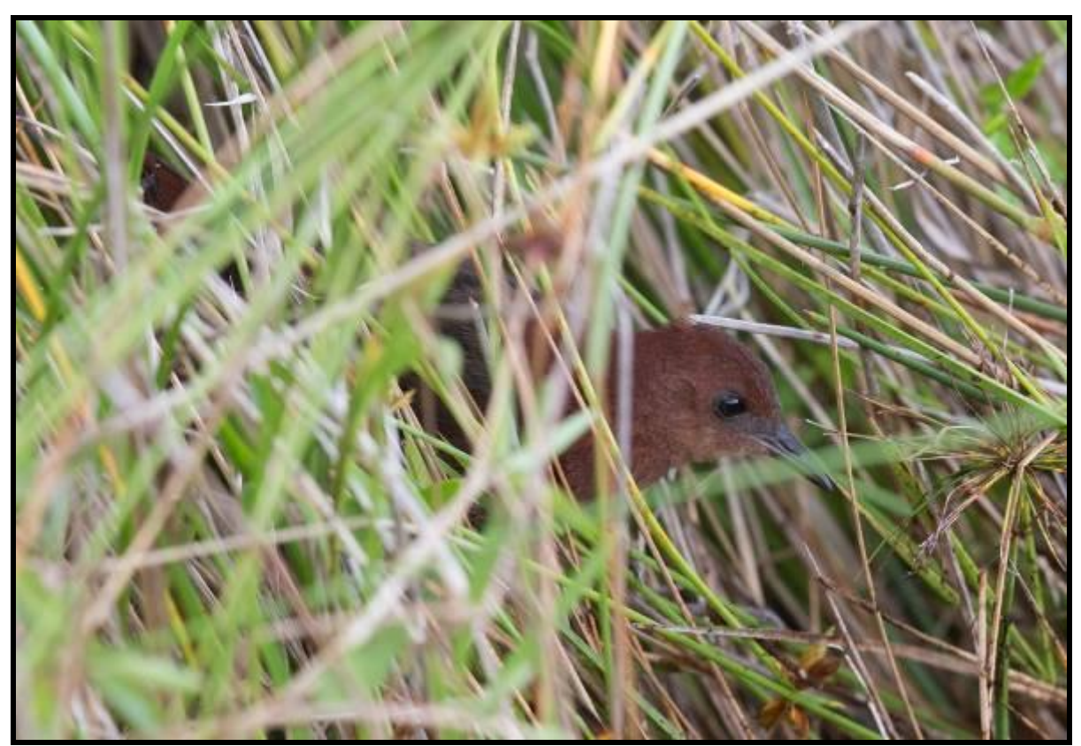
Slender-billed Flufftail - Sarothrura watersi