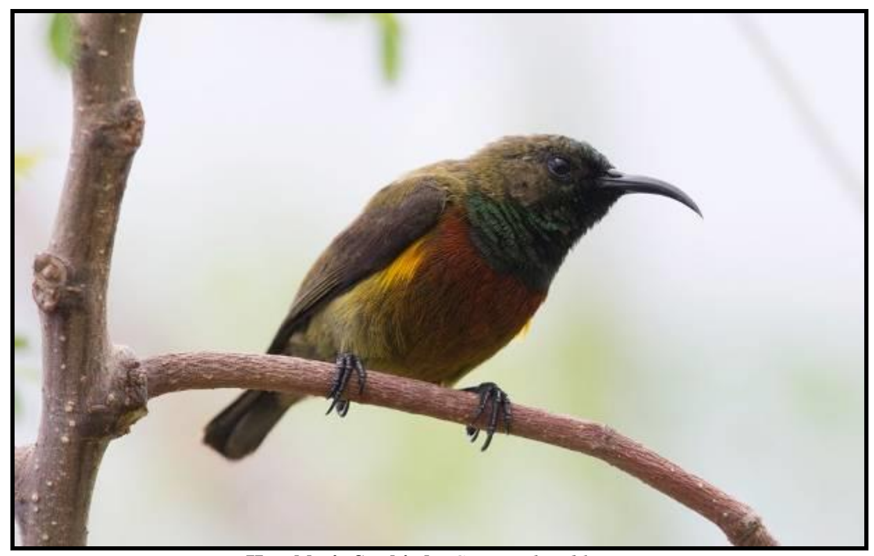
Humblot's Sunbird - Cinnyris humbloti