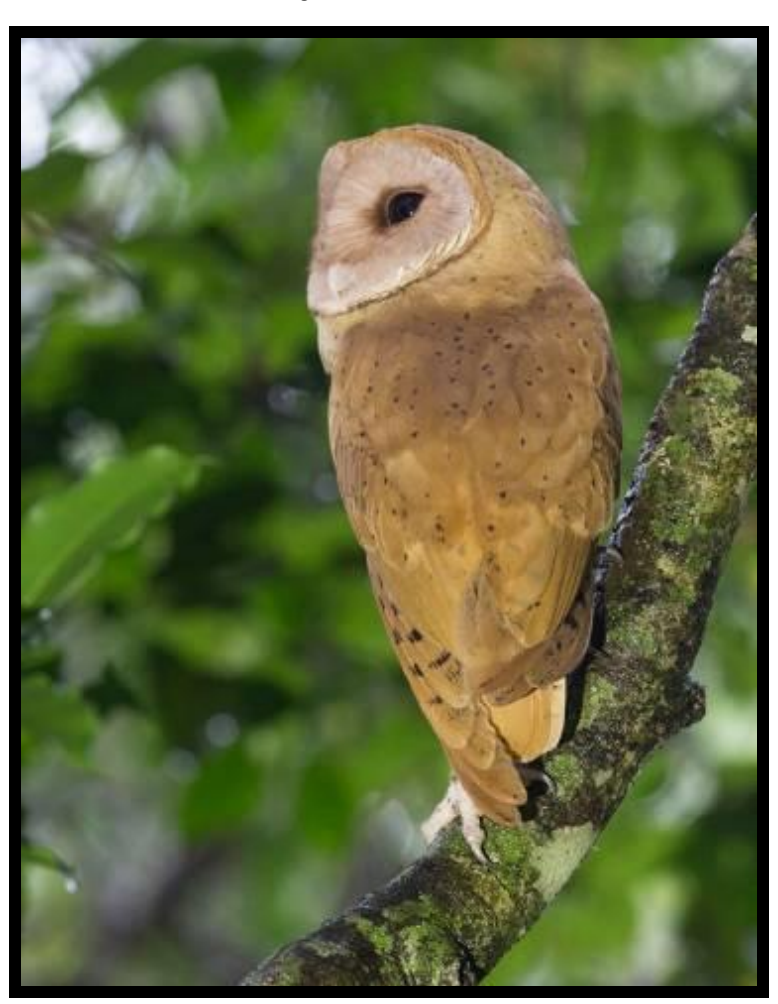
Red Owl - Tyto soumagnei , voted bird of the trip