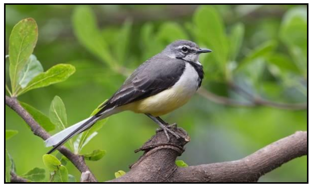
Madagascan Wagtail - Motacilla flaviventris

for the long haul, because in the morning we would be heading towards Bealanana for Madagascar's true avian gems.