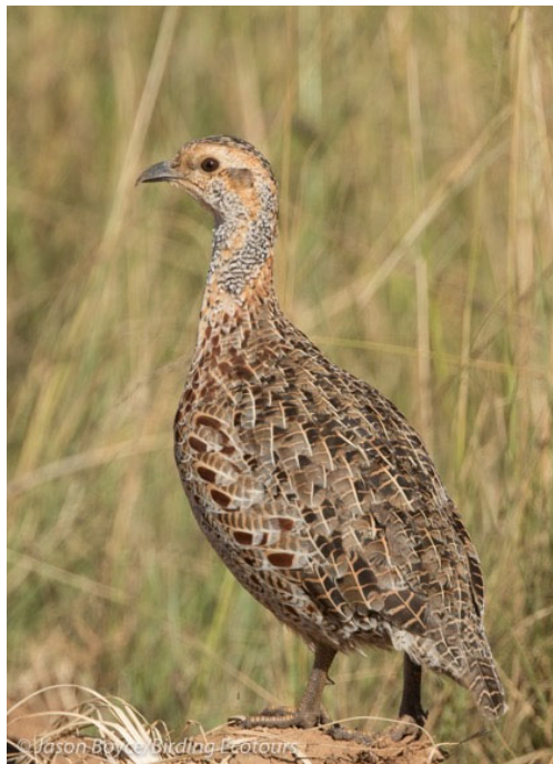
Grey-winged Francolin, Wakkerstroom surrounds