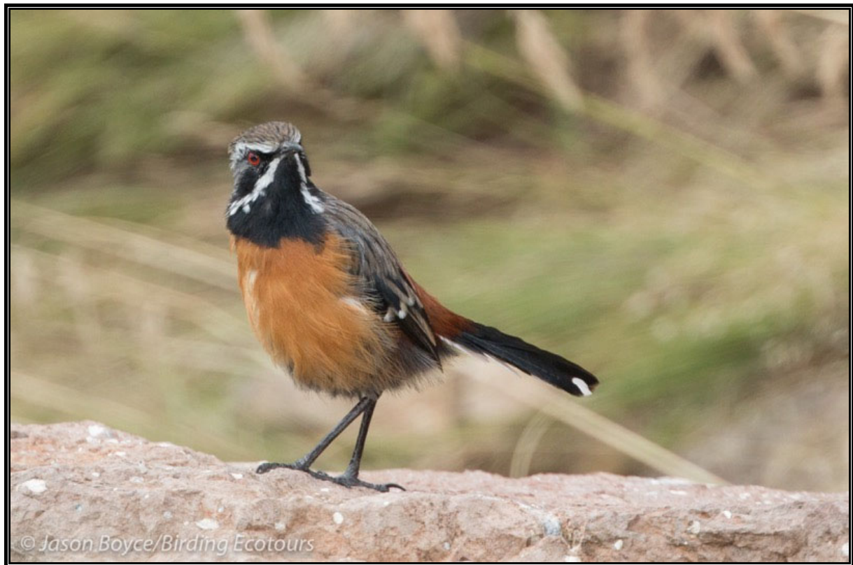
Drakensberg Rockjumper – One of the birds of the trip!