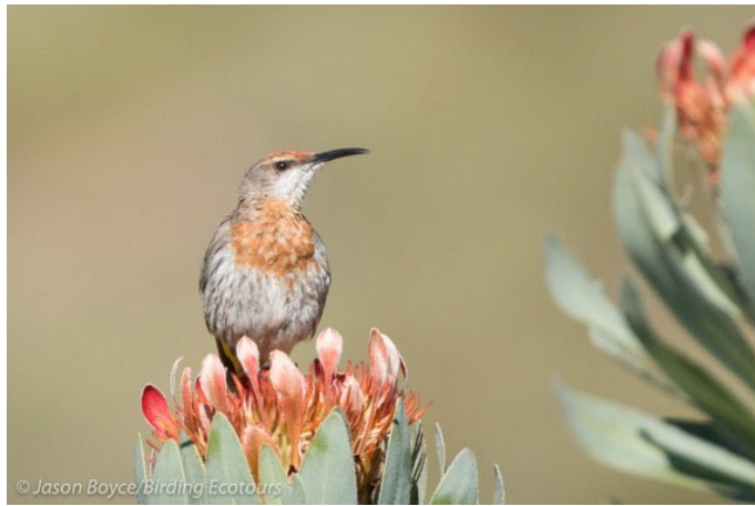
Gurney's Sugarbird, Sani Pass

A true birding highlight was the day trip up Sani Pass into Lesotho. We could not have asked for a better day to head up the pass in terms of weather, and, as we would find out later, the birding was incredible too! Both Bush Blackcap and Cape Grassbird showed well for us at the base of the pass, while further along we were able to enjoy stunning looks at a pair of Gurney's Sugarbird feeding on a large Protea bush alongside the road – a definite highlight! A couple of distant storks and vultures, including, Cape Vulture and Black as well as White Storks circled high above us as we started the main ascent. The endemic and striking Drakensberg Rockjumpers were actively moving around the rocks feeding, not at all bothered by our presence. We enjoyed an amazing interaction between a Verreaux's Eagle and a Jackal Buzzard on the slopes above us, while Fairy Flycatcher was calling behind us. Bearded Vultures were yet another highlight for us today – no less than two individuals circled high alongside the steep cliff face, where they had been breeding the past season. We also enjoyed a productive walk on one of the shrubby slopes, where we picked up Grey Tit , Layard's Warbler , Drakensberg Siskin , and Sentinel Rock Thrush , as well as a pair of Mountain Pipit . Mammals included grey rhebok, rock hyrax, and Sloggett's vlei rat.