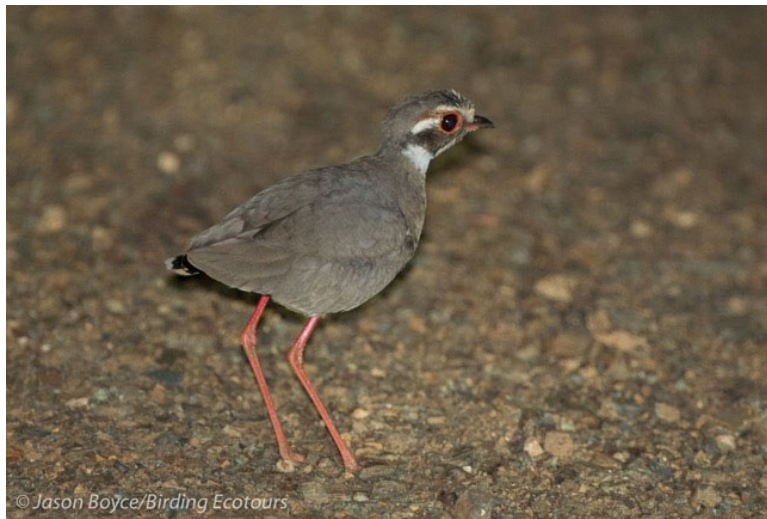
Bronze-winged Courser, Mkhuze Game Reserve