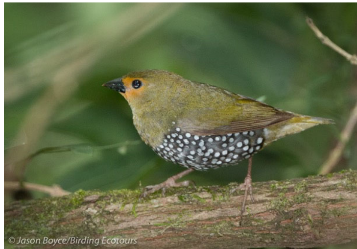
Green Twinspot, iSimangaliso Wetland Park

The iSimangaliso Wetland Park is a UNESCO world heritage site, and it truly offers a fine day out birding and mammal watching! African Jacana , Blue-cheeked Bee-eater , European Roller (over 30 individuals), and Black-chested and Brown Snake Eagles were some of the first species that we recorded, while a number of African buffalos were seen grazing away in the distant grasslands. We slowly worked our way towards Cape Vidal, taking some of the side road loops. Some of these were productive, and we recorded the likes of Striped Kingfisher , Red-breasted Swallow , Red-backed Shrike , Yellow-throated Longclaw and the zygodactyl Burchell's Coucal . Green Twinspot was one of the highlights on a small trail toward a lookout point over Lake St Lucia, while Senegal Lapwing and Woolly-necked Stork were seen in the open areas toward the shoreline of the lake. Two white rhino were really great to see as we were leaving the reserve in the afternoon, a relief for some of us, as things on the mammal front had been fairly slow for most of the day.