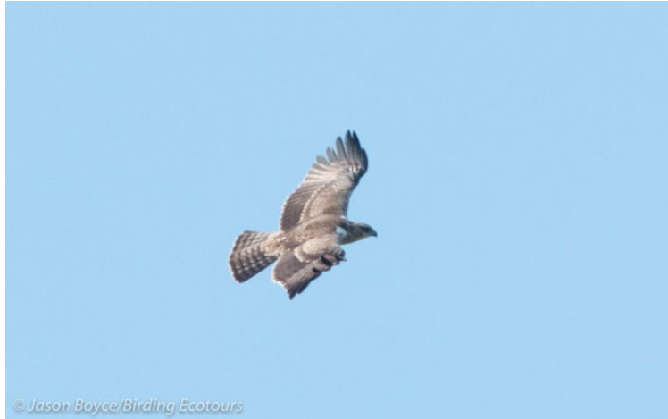
Juvenile Ayres's Hawk-Eagle, between Skukuza and Lower Sabie