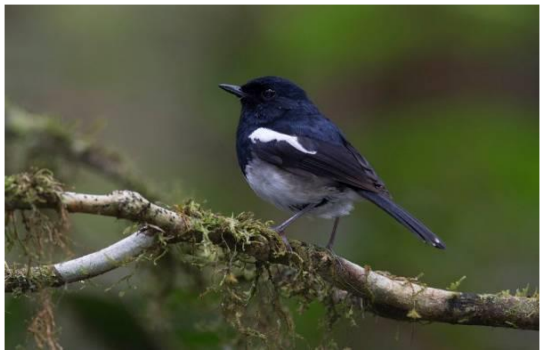
Madagascan Magpie-Robin - Copsychus albospecularis

Andasibe yielded great views of eastern lesser bamboo and brown lemurs. Birds were active after the rain, and we enjoyed Madagascan Magpie-Robin, Malagasy Bulbul, Spectacled Tetraka, Long-billed Bernieria, White-throated Oxylabes, Madagascan Wood Rail, Rand's Warbler, Malagasy Coucal, Malagasy Kingfisher, roosting Rainforest Scops Owl, Greater Vasa Parrot, Madagascan Cuckooshrike, and a few others. Occasional feeding flocks also generated Blue, Tylas, Red-tailed, and White-headed Vangas, while Crested Drongo, Malagasy Paradise Flycatcher, Nelicourvi Weaver, Red Fody, and Madagascan Swamp Warbler were quickly outshone by the elusive Red-breasted Coua and its close relative, Blue Coua. After a failed attempt at locating Madagascan Flufftail we enjoyed our first dinner of the trip and prepped for a long day in the field in the morning.