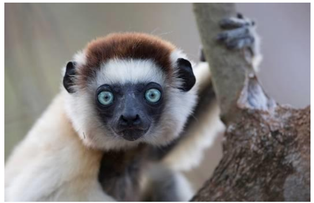
Verreaux's sifaka - Propithecus verreauxi

Appert's Tetraka, Lesser Vasa Parrot, Coquerel's Coua, Malagasy Paradise Flycatcher. Standing's day gecko, Verreaux's sifaka, and the cute nocturnal Hubbard's sportive lemur all showed well before we made our way to Ifaty.