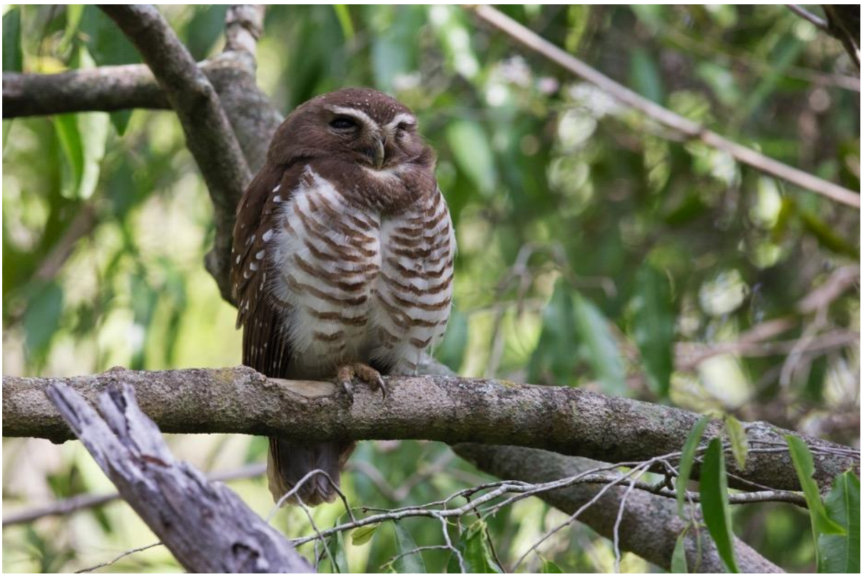
White-browed Hawk-Owl - Ninox superciliaris