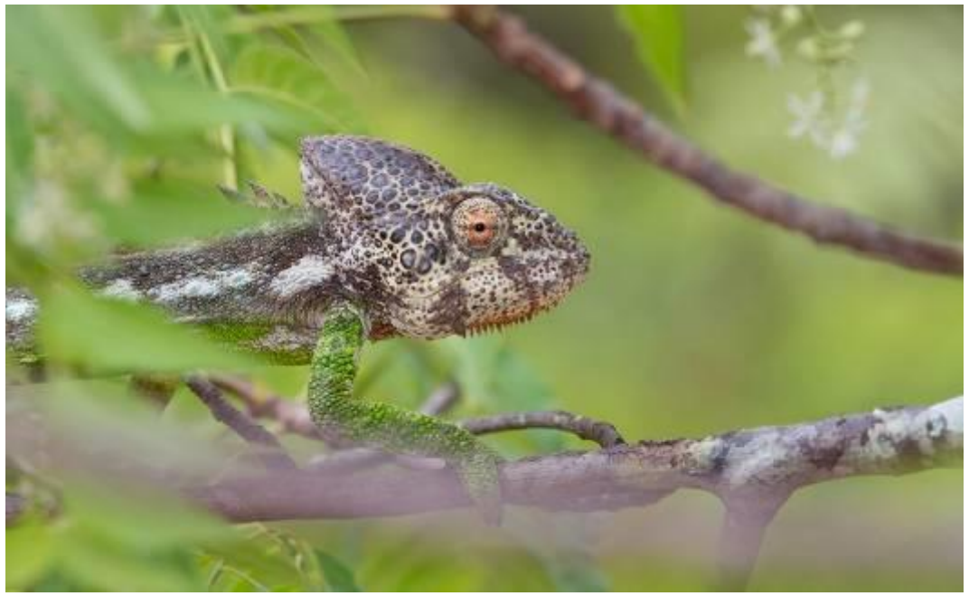
Warty chameleon - Furcifer verrucosus

After breakfast the vehicles were packed and we started heading west towards the Berenty Reserve. The 90-kilometer road, which has remained untouched for the last 60 years, was quite an experience and took a good portion of the morning. Flooded rice paddies and lush roadsides produced Pied Crow, Red Fody, Yellow-billed Kite, Striated Heron, Hamerkop, Great Egret, Dimorphic Egret , and some others before we reached Berenty Reserve itself. Here we were greeted by ring-tailed and red-fronted brown lemurs and the likes of Crested Drongo, Sakalava Weaver, Common Jery , and a few others.