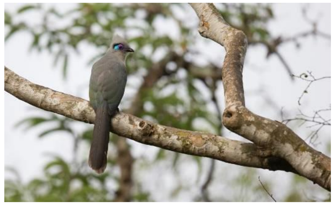
Crested Coua - Coua cristata

Again, Madagascan Sandgrouse was our only target, and again it eluded us. The recent rains may have kick-started nesting cycles, and the birds were no longer visiting their usual feeding grounds. Black Kite, Yellow-billed Kite, Malagasy Coucal, Western Cattle Egret, Crested Coua, Crested Drongo, and a few other species were present in the sisal fields as well as a pair of uncommon migrants in the form of Harlequin Quail.