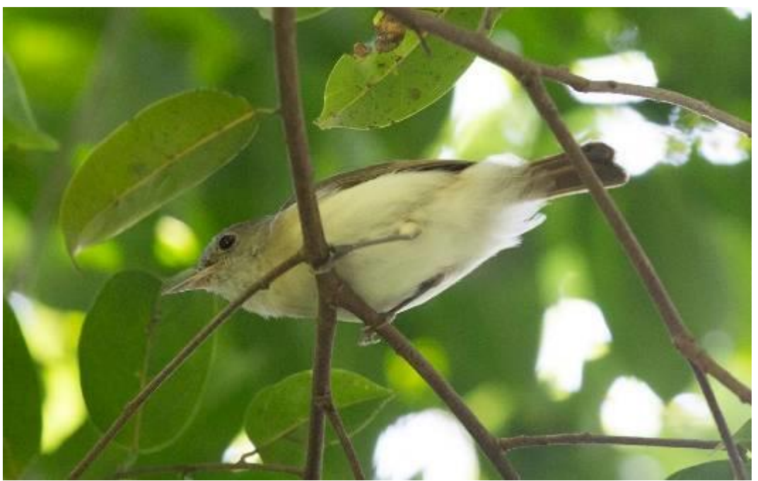
Red-tailed Newtonia - Newtonia fanovanae

We made our afternoon flight back to the capital in good time and picked up an obliging Sooty Falcon sitting on the terminal building upon our departure before making our way to the hotel.