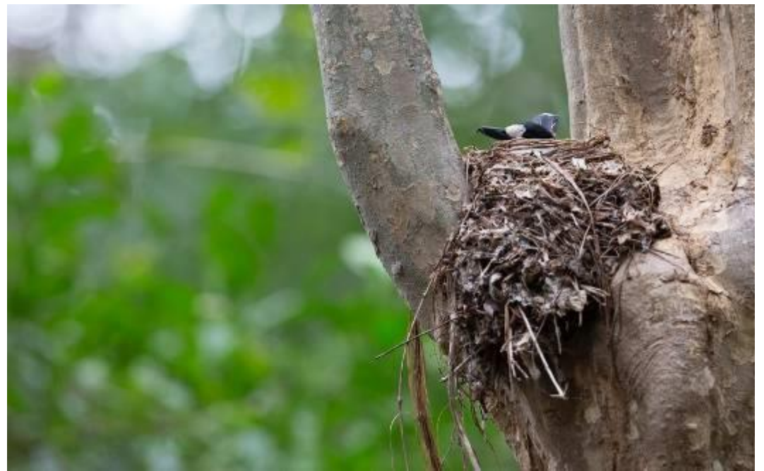
Hook-billed Vanga - Vanga curvirostris

Rand's Warbler entertained us, as did Pitta-like Ground Roller and Souimanga and Malagasy Green Sunbirds.