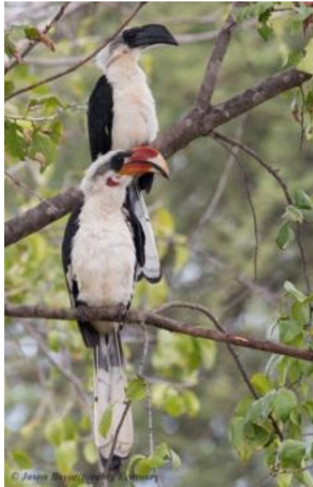
Von der Decken's Hornbill

There is surely incredible avian diversity in Tarangire National Park, but it also offers incredible scenery! One of my personal favorite scenes was experiencing the magical baobab trees. These trees are literally littered all over the park – some of them truly gigantic!