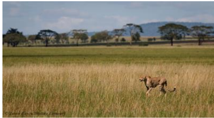
Cheetah in the Serengeti's "endless plains"

And so after that amazing experience of both leopard and cheetah our birding venture to the central Serengeti continued. A couple-hours' drive through some very scenic areas led us to an area in which we picked out the sought-after Karamoja Apalis as well as Grey-capped Social Weaver , the usambiro subspecies of D'Arnaud's Barbet , Three-banded and Temminck's Coursers , Kenya Sparrow , and Blue-capped Cordon-bleu . A leisurely drive back to our lodge was just what we needed to process the last two days spent in the Serengeti paradise.