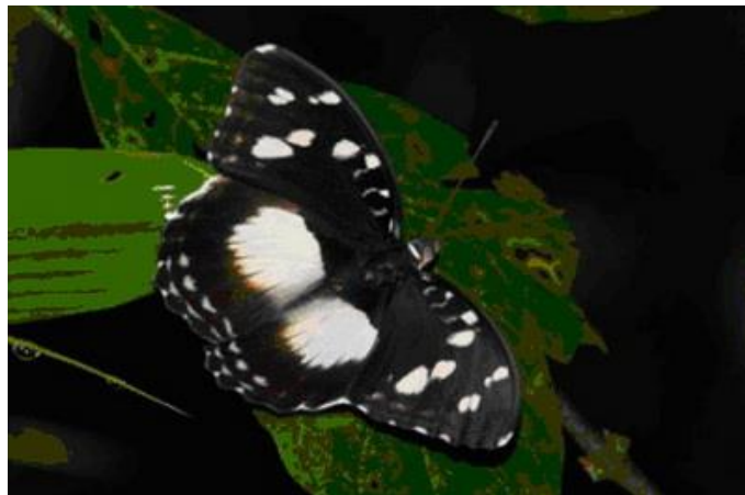
Forest glade nymph, one of many extraordinary butterfly species seen during our two days in the park.

The reserve also has more than 400 species of butterflies, some of which are absolutely gorgeous. Many an hour can be spent wandering the forests here in the Udzungwa Mountain National Park.