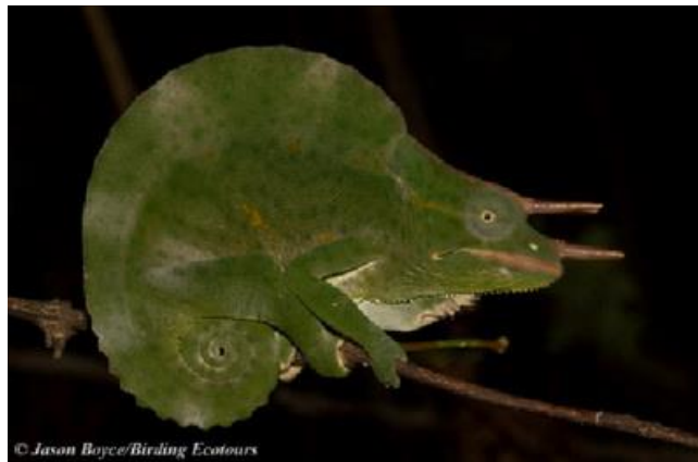
Usambara three-horned chameleon

The forests surrounding Amani here in the East Usambaras are also home to a number of absolutely fascinating endemic chameleons. A very productive walk into the forest at night, specifically looking for chameleons and Usambara Eagle-Owl, was enjoyed by some. Whilst we did not find the owl, we did manage to find a few fascinating chameleons.