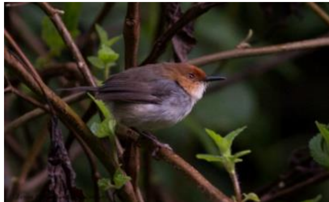
Red-capped Forest Warbler