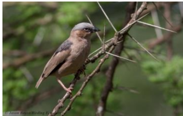
Grey-capped Social Weaver