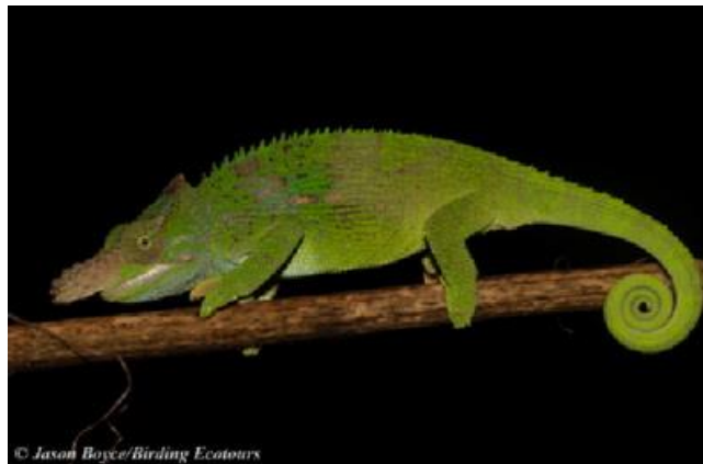
West Usambara blade-horned chameleon