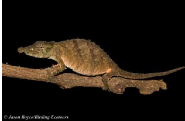
Usambara spiny pygmy chameleon

Today we drove from Amani to Lushoto in the West Usambara Mountains. The difference between the two mountain chains is remarkably different, even though the distance between the two – as the turaco flies – is really not too far. Compared to the East Usambaras Lushoto is cold and misty, with a fair amount of drizzle in the mornings. The birding also differs greatly, and both sites have species that the other does not have – spending a couple of nights at both locations is crucial.