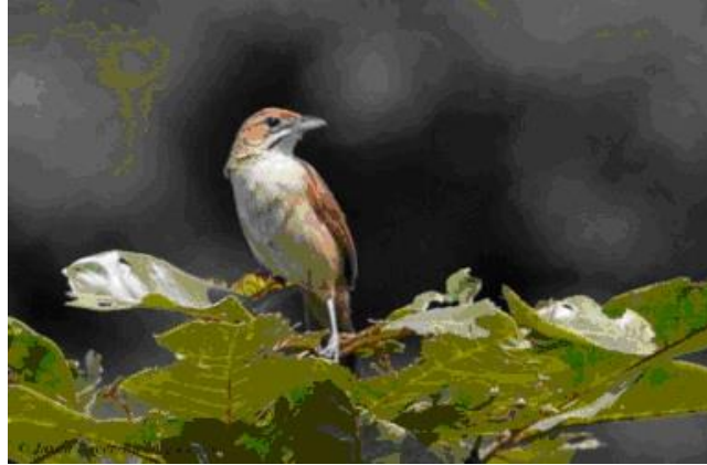
Moustached Grass Warbler

Our day ended on a high with the first colobus monkey of the trip in the form of the endemic Udzungwa red colobus.