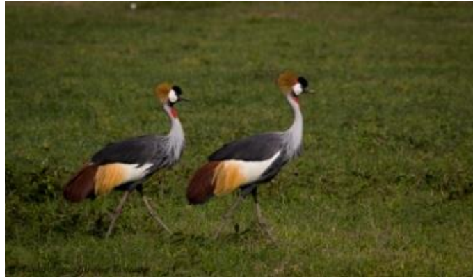
Grey Crowned Crane

The day ended sooner than we wanted it to, but we still managed to sneak in some amazing sightings of Golden-winged and Tacazze Sunbirds as well as a Montane Nightjar around the lodge just after dark – almost the perfect day!