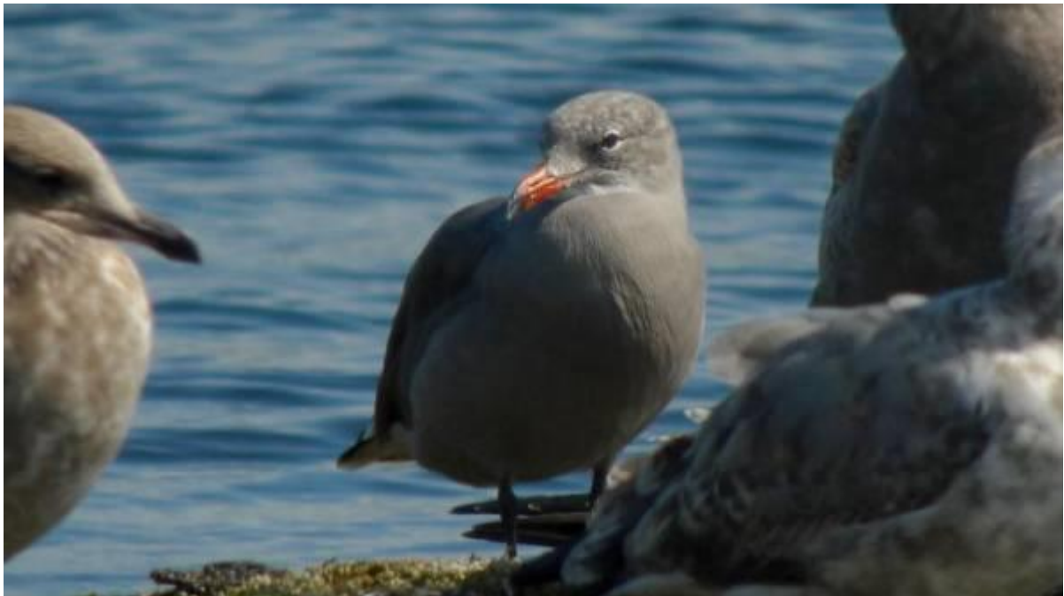
Heermann's Gull seen from Clover Point

Our next stop included a nearly one-mile walk on the Ogden Point breakwall. This did not yield the Wandering Tattler that we had been hoping for, but we did get better views of Pigeon Guillemot and a very close flock of 26 Black Turnstones .