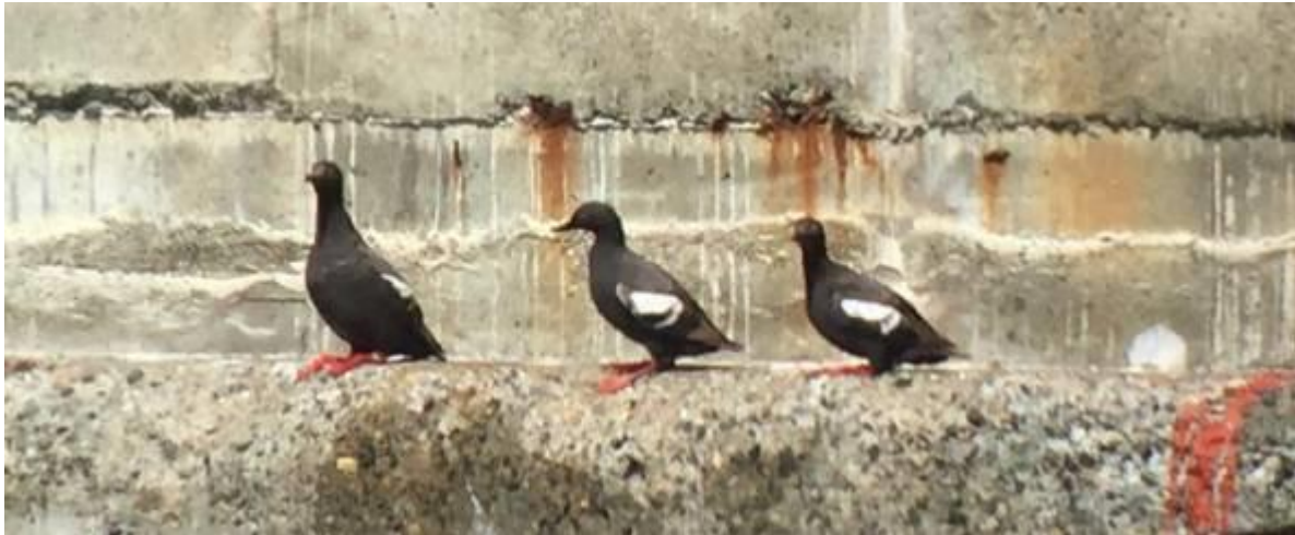
Pigeon Guillemots on the Ogden Point breakwall

After lunch we drove inland to search for an American Dipper that was nearly guaranteed. We arrived at Goldstream Provincial Park and were immediately greeted by a team of young Steller's Jays in the parking lot. As we walked along the streamside path we had some great looks at Belted Kingfisher and beautiful old-growth forest. We wandered along without seeing the dipper but didn't want to give up. Finally I climbed onto a cement guard rail and looked beyond a log dam in the stream. There was the American Dipper just on the other side! Next came the challenge of finding a way to view the bird other than by standing on the barrier. It didn't take long to find a side trail that went downstream and opened up into a small clearing right next to the bird! We enjoyed a spectacular show put on by the diving and foraging bird. We watched it through the spotting scope and were able to get photos and videos of the active dipper.