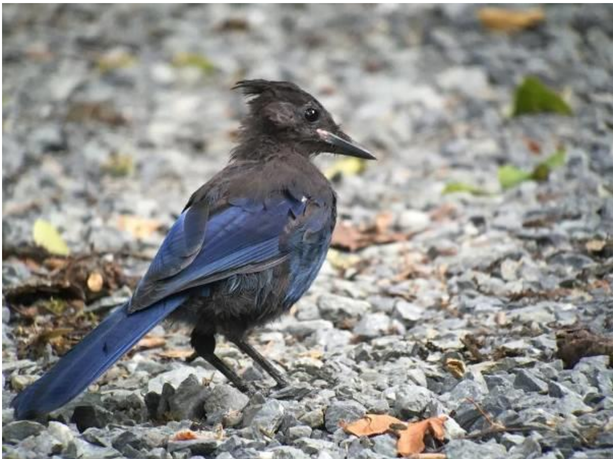
Juvenile Steller's Jay at Goldstream Provincial Park (photo by Ben Warner)