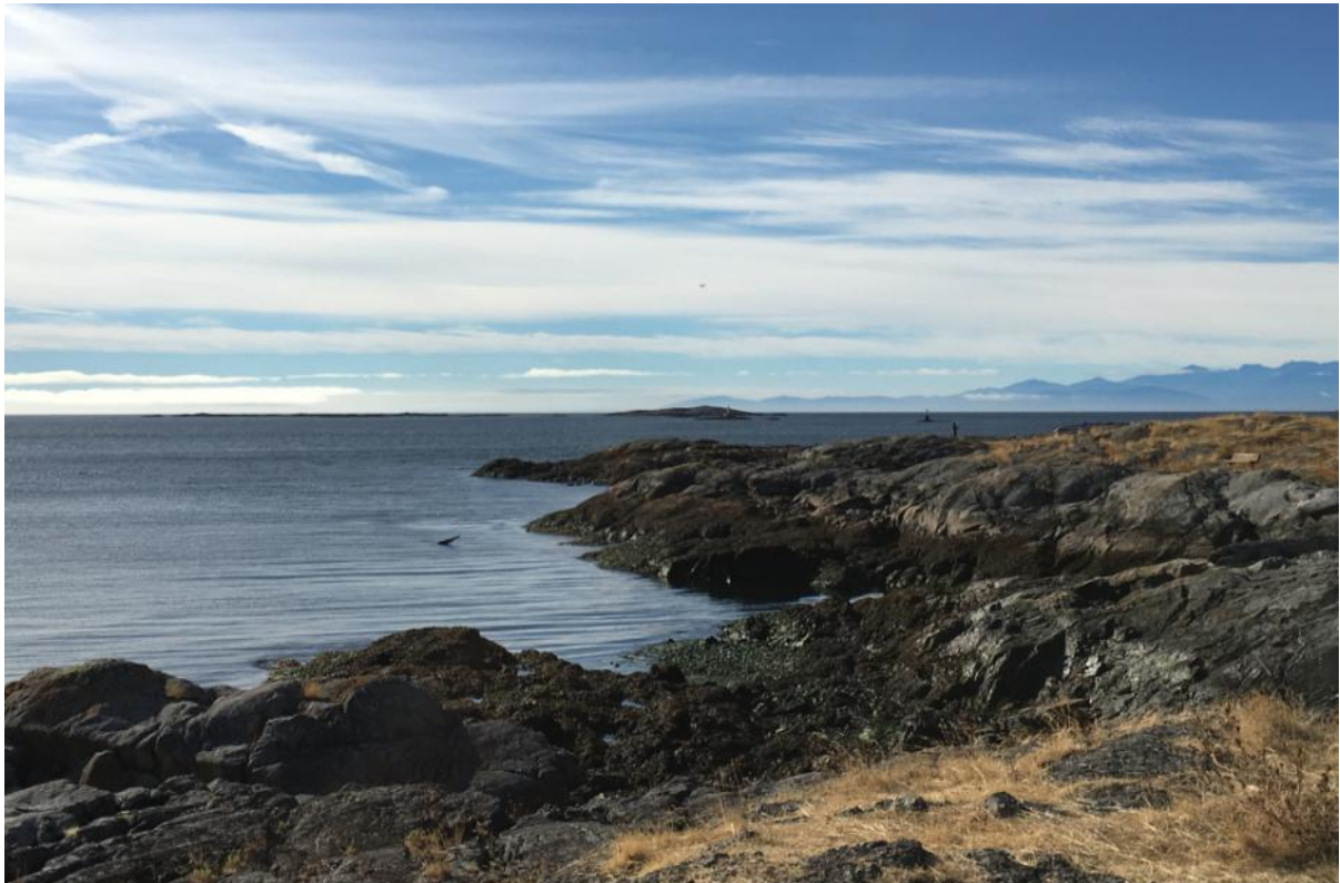
Cattle Point

To get out of the wind we moved to a more inland part of the park. Here we were treated to both Anna's Hummingbird and the seasonally harder-to-find Rufous Hummingbird . Although passerines were scarce due to two actively hunting Cooper's Hawks , we did find several Bewick's Wrens skulking in the brush.