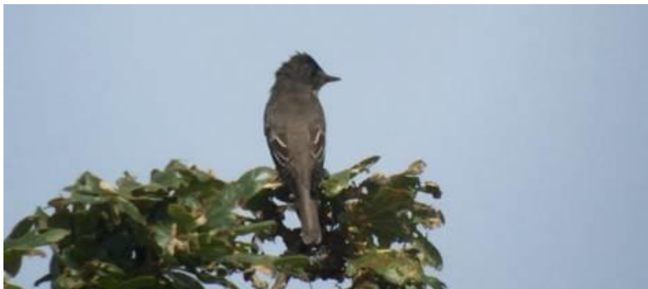
Western Wood Pewee at Christmas Hill