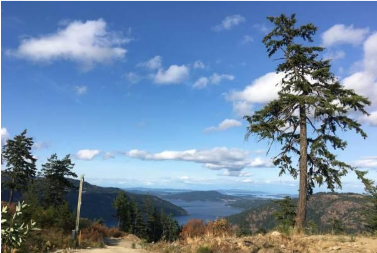
The view just after spotting a Western Tanager