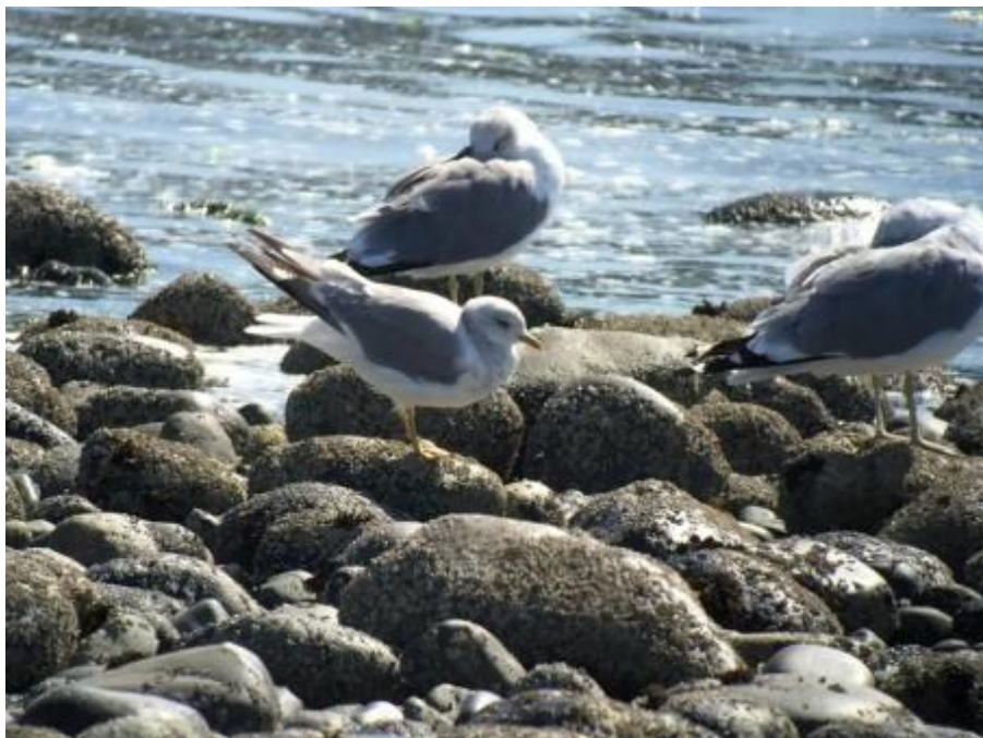
Mew Gull with two sleeping California Gulls

Early in the morning we boarded the Black Ball Ferry to cross the Strait of Juan de Fuca from Vancouver Island to the Olympic Peninsula of Washington State. As the morning fog cleared, tiny harbor porpoises danced across the water's surface. Rhinoceros Auklets landed just off the side of the boat for spectacular last views of this species. A lone gray whale, which was much larger than the orcas we had seen just days before, made his presence known with a blow and then a dorsal fin. It came up for air twice before taking a deep dive. After showing its flukes we didn't see it again. The ferry ride concluded the Vancouver Island birding tour for 2017. We ended with 78 avian species throughout the tour, which are listed below.