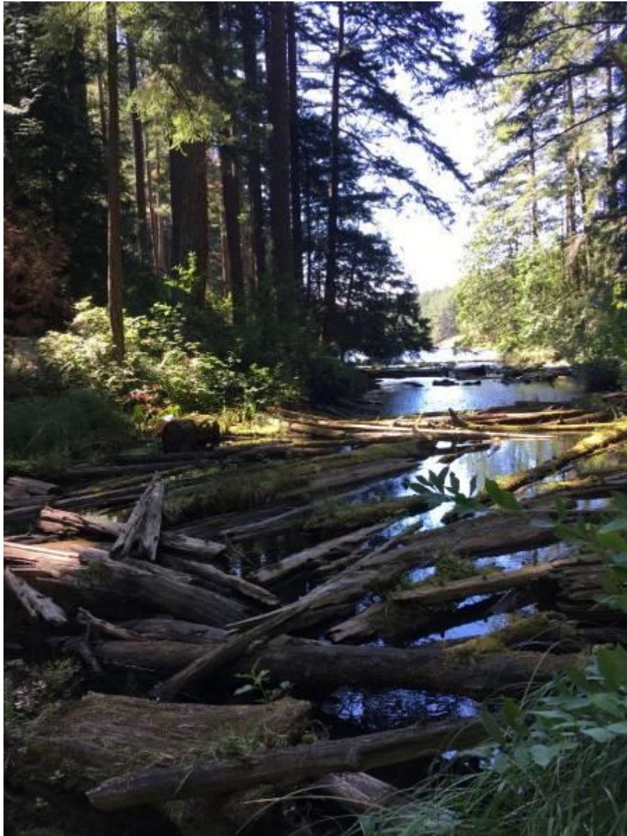
A view of Cranberry Lake

While waiting for the ferry we ate lunch and added Pelagic Cormorant , Northwestern Crow , Pigeon Guillemot , Mew Gull , California Gull , and Glaucous-winged Gull to our trip list. Aboard the ferry through the San Juan Islands a pod of four orcas swam close to the boat, including at least one baby! We also got our first looks at Common Murre and Marbled Murrelet .