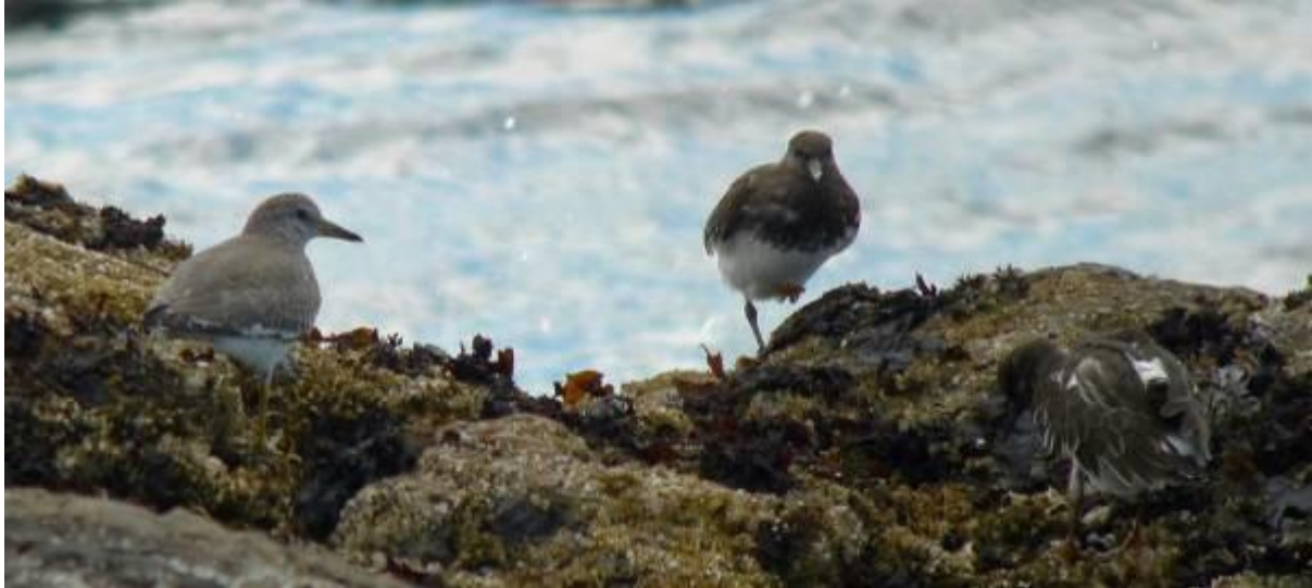
A Surfbird with two of the Black Turnstones we saw at Cattle Point

We started the morning at Cattle Point, where the high winds kept our visit brief. Nevertheless, we were able to find Harlequin Duck , Black Oystercatcher , Black Turnstone , Surfbird , and Heermann's Gull .