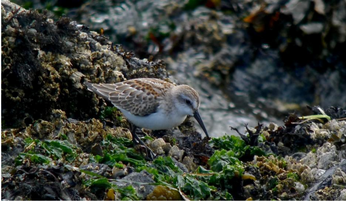
Western Sandpiper at Clover Point

Next we visited Clover Point Park. Despite the incessant winds we scored fantastic scope views of Surfbird and Western Sandpiper . As we continued to scan with the scope we found a closer Heermann's Gull and more distant Rhinoceros Auklet and Marbled Murrelet .