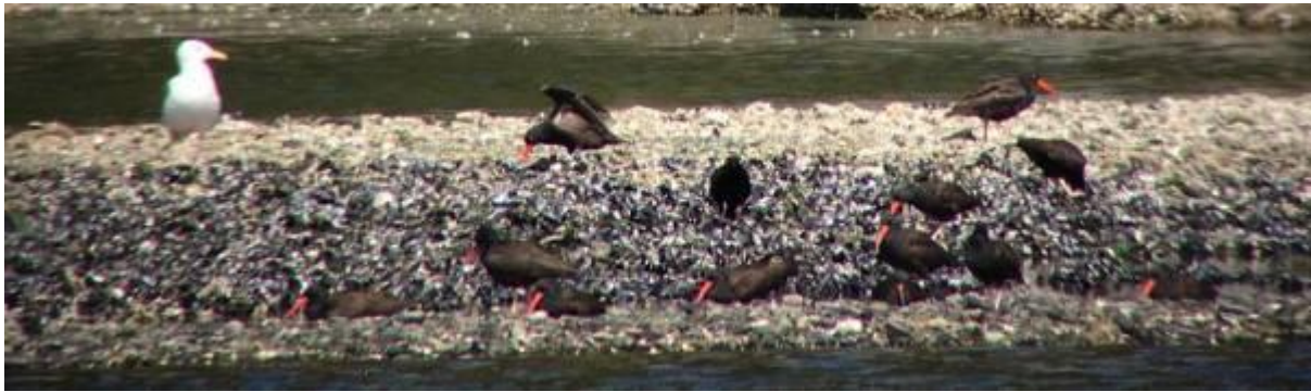
Black Oystercatchers at Esquimalt Lagoon

Due to the solar eclipse the following day the ferries required an extra-long waiting time. As a group we opted not to spend the rest of the day waiting in line, so we continued to bird and left early the next morning. With our extra time we visited the Royal Roads University campus. Here we came across a beautiful Merlin that, due to regional differences, was all black. It was an exceptionally gorgeous individual. Near the Merlin many Violet-green Swallows were aerially catching insects. On our way back to the hotel we drove along the dike at Esquimalt Lagoon and added Brewer's Blackbird and Trumpeter Swan to our trip list! We also saw a nice group of Black Oystercatchers gathered on an island in the lagoon.