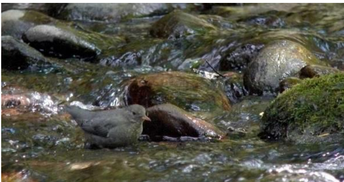
American Dipper, a highlight of the tour

Once we were all satisfied with the American Dipper we moved on to look for Northern Pygmy Owl. We did not have any success, or much time left in the day. We could not complain about the incredible scenery, though! As we drove up the mountains the view over the valley and channel was remarkable. Along the way we spotted Western Tanager from the vehicle.