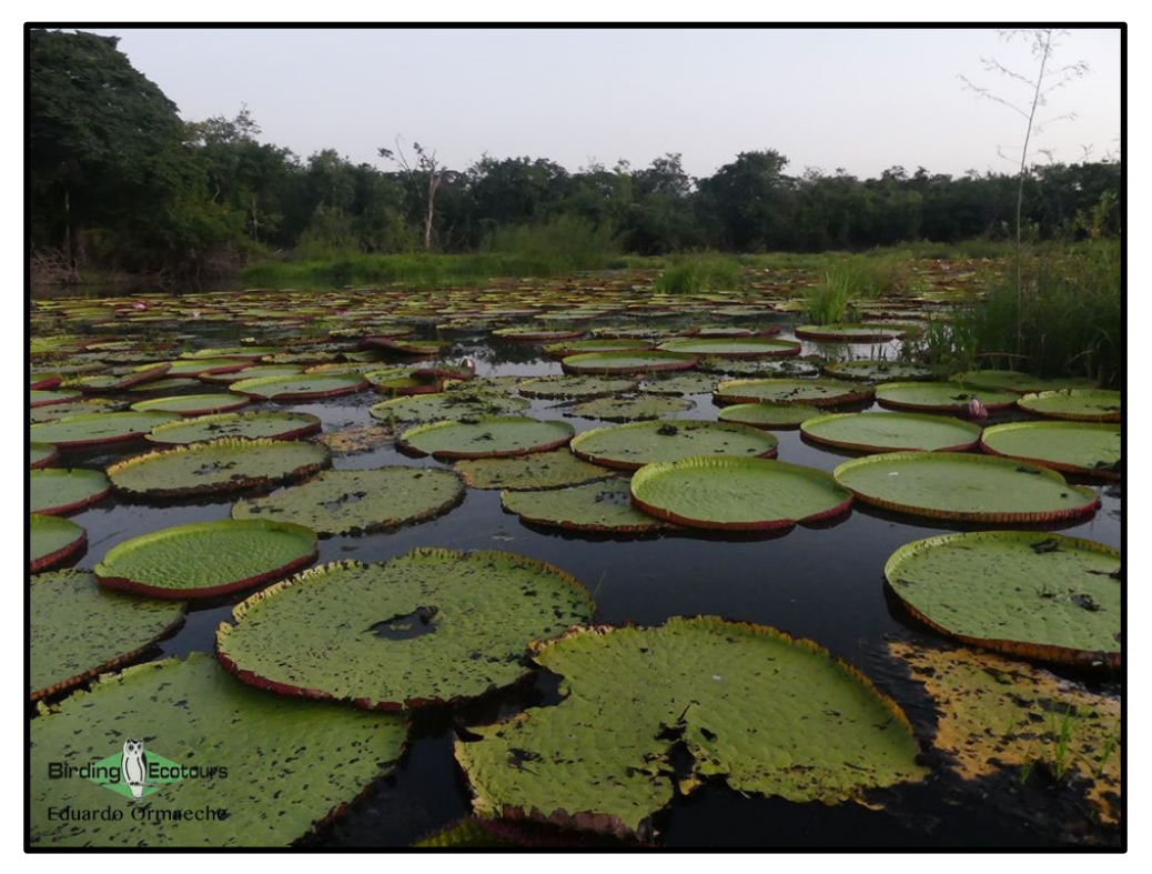
Giant Water Lily

In the afternoon we made another boat trip, having great views of the species we had seen on the previous day plus Long-winged Harrier, Plumbeous Kite, Double-toothed Kite, Red-and-green Macaw, and brief but great views of Crestless Curassow. We also visited an oxbow lake to see the amazing Giant Water Lily ( Victoria amazonica ), the world's largest water lily and the national flower of Guyana. At dusk we returned to the lodge, seeing Band-tailed Nighthawk and Tropical Screech Owl close to it.