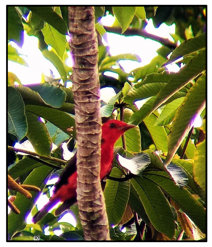
Crimson Fruitcrow

We had only a couple of hours at Atta Rainforest Lodge before we were transferred to Iwokrama River Lodge and from there to take our charter flight to Georgetown. We decided to spend those hours in the lodge clearing and scan all the trees arounds. The strategy paid off, finally giving us scope views of the most-wanted Crimson Fruitcrow . What a way to finish our stay at Atta Rainforest Lodge!