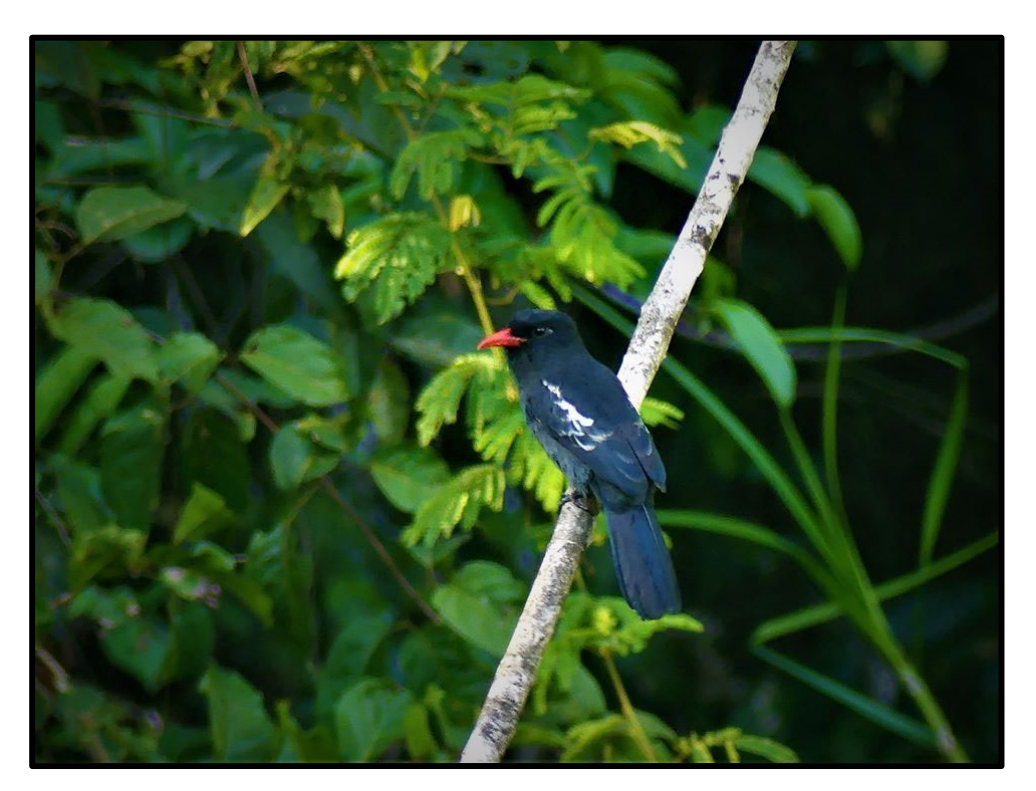
Black Nunbird