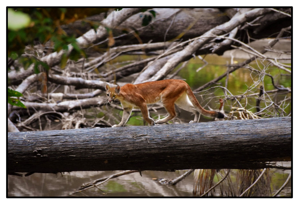
Puma