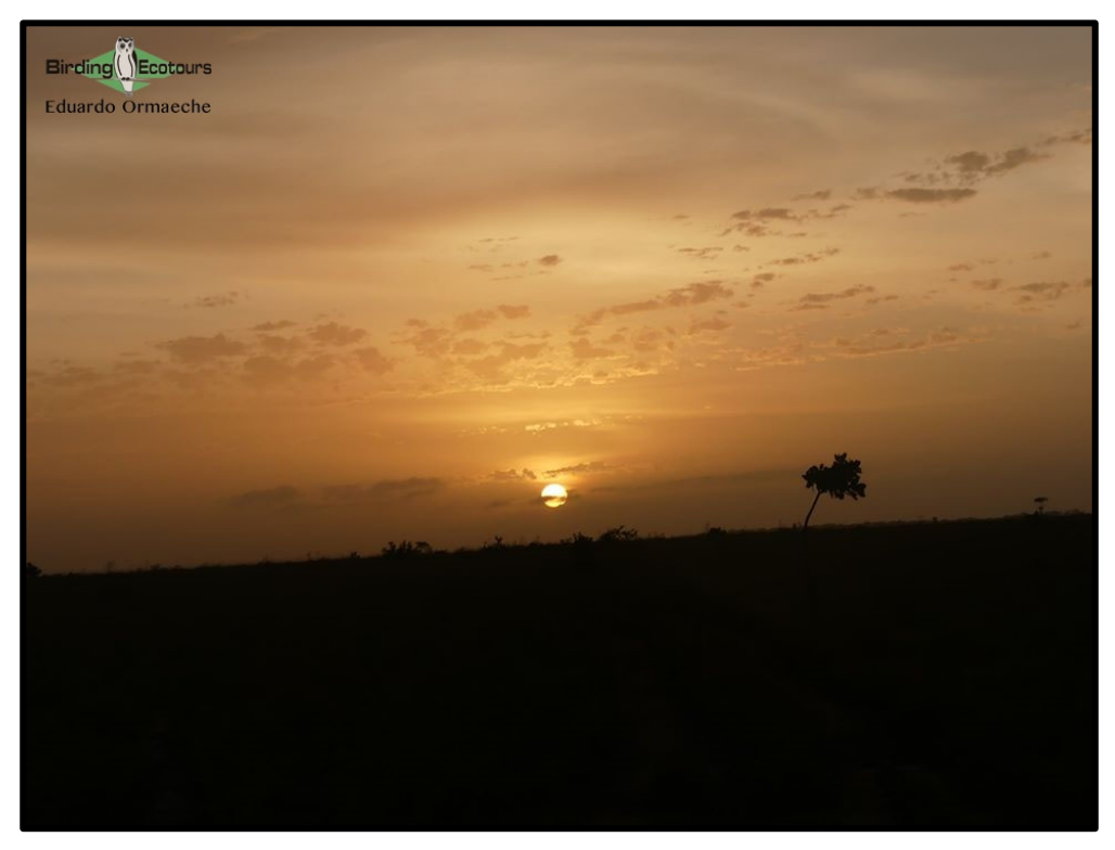
A magical Guianan sunrise!

From Eugene Correia International Airport again we took a flight to Lethem, a remote town just on the border with Brazil in south-western Guyana. Here we were picked up by a 4x4 vehicle for a long drive to Karanambu Lodge in the northern Rupununi region. After lunch we went on a boat trip, which provided great birding with species such as Green Ibis, Grey-necked Wood Rail, Purple Gallinule, Limpkin, Black Skimmer, Large-billed Tern, Sunbittern, Cocoi Heron, Great Black Hawk, Western Osprey, Boat-billed Heron, Capped Heron, Ringed, Green, and Amazon Kingfishers, Muscovy Duck, Pale-vented Pigeon, Wattled Jacana, and Jabiru.